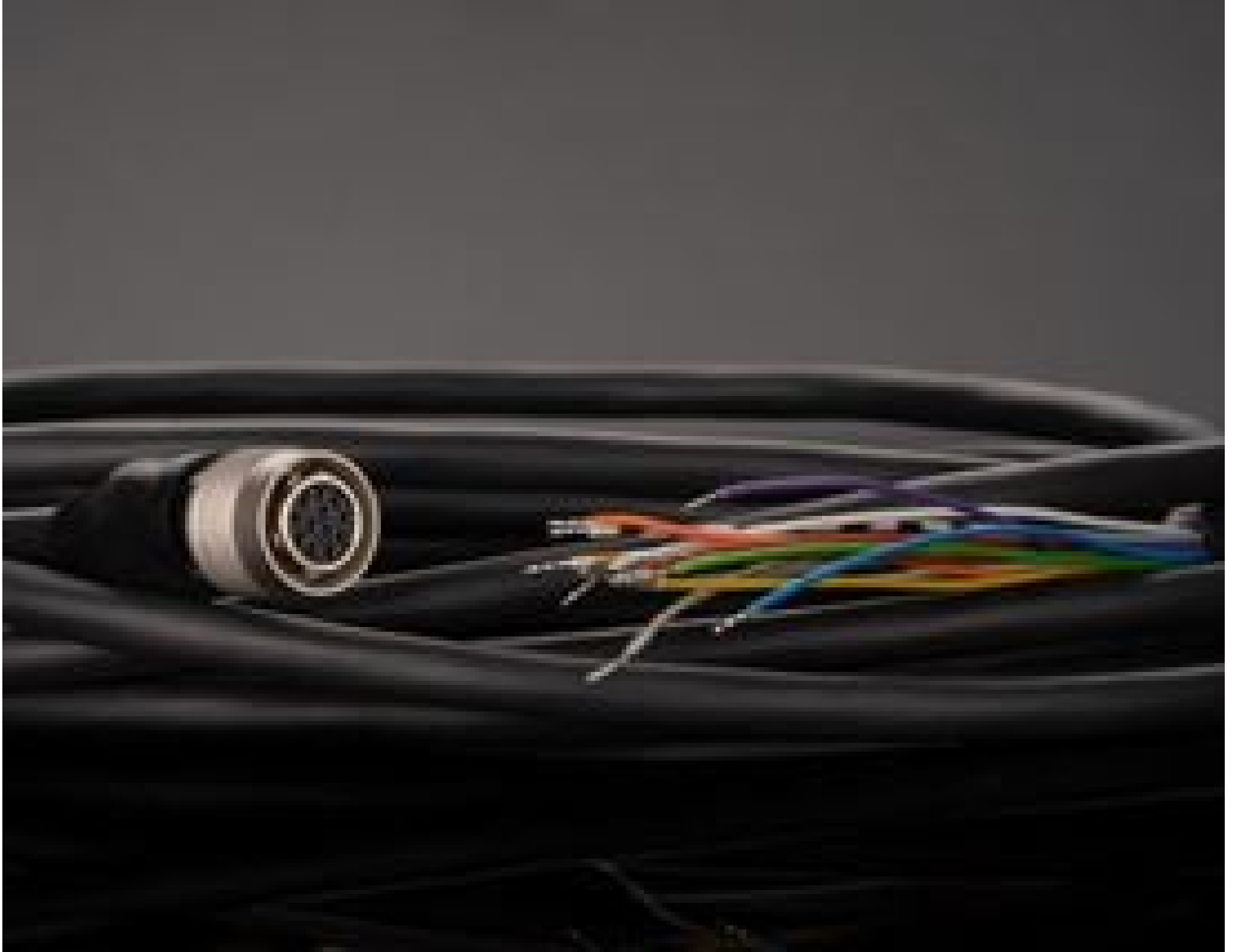
12-pin Hirose I/O Cable, 5m (#62-712)