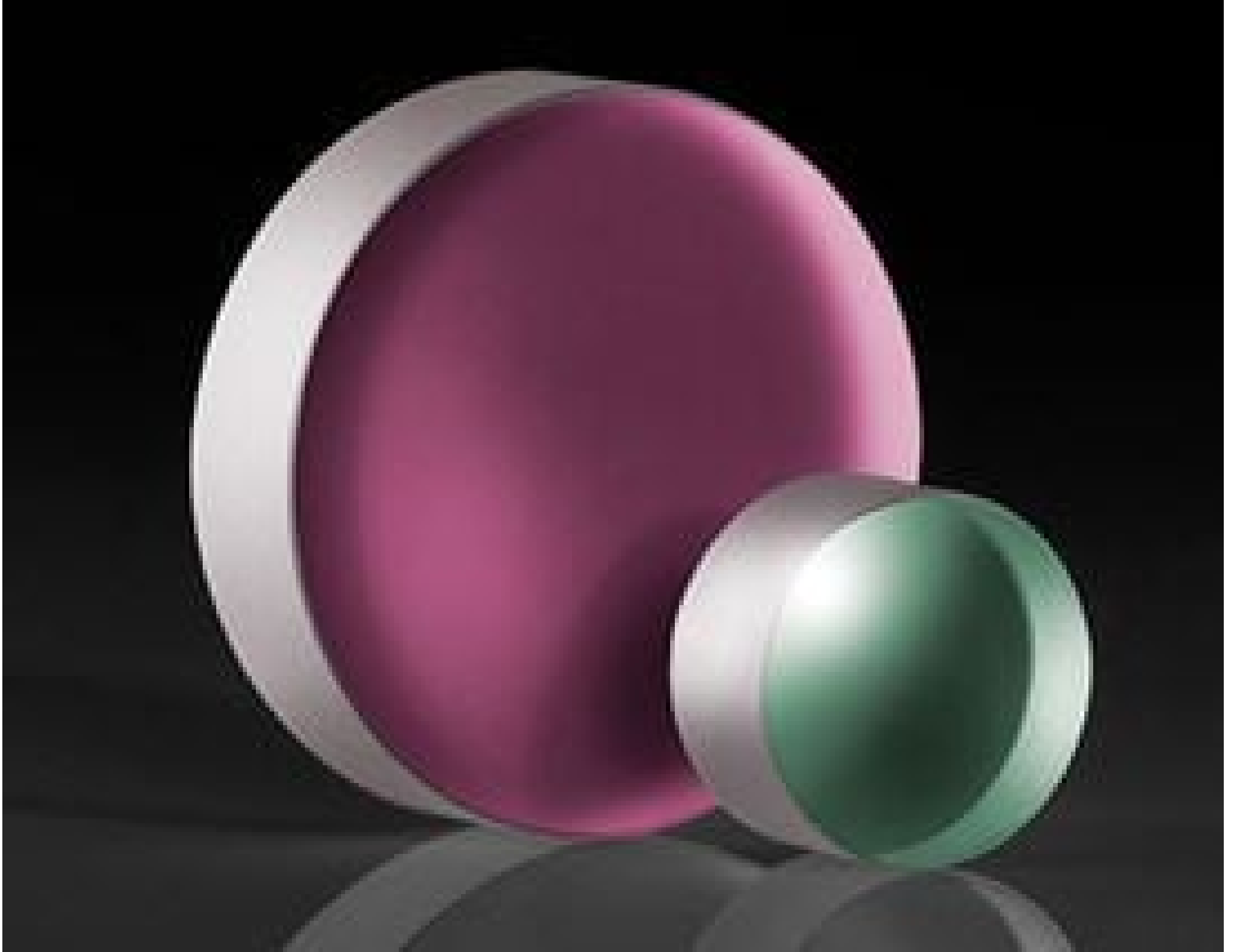
UltraFast Innovations (UFI) 800nm Highly-Dispersive Ultrafast Mirrors