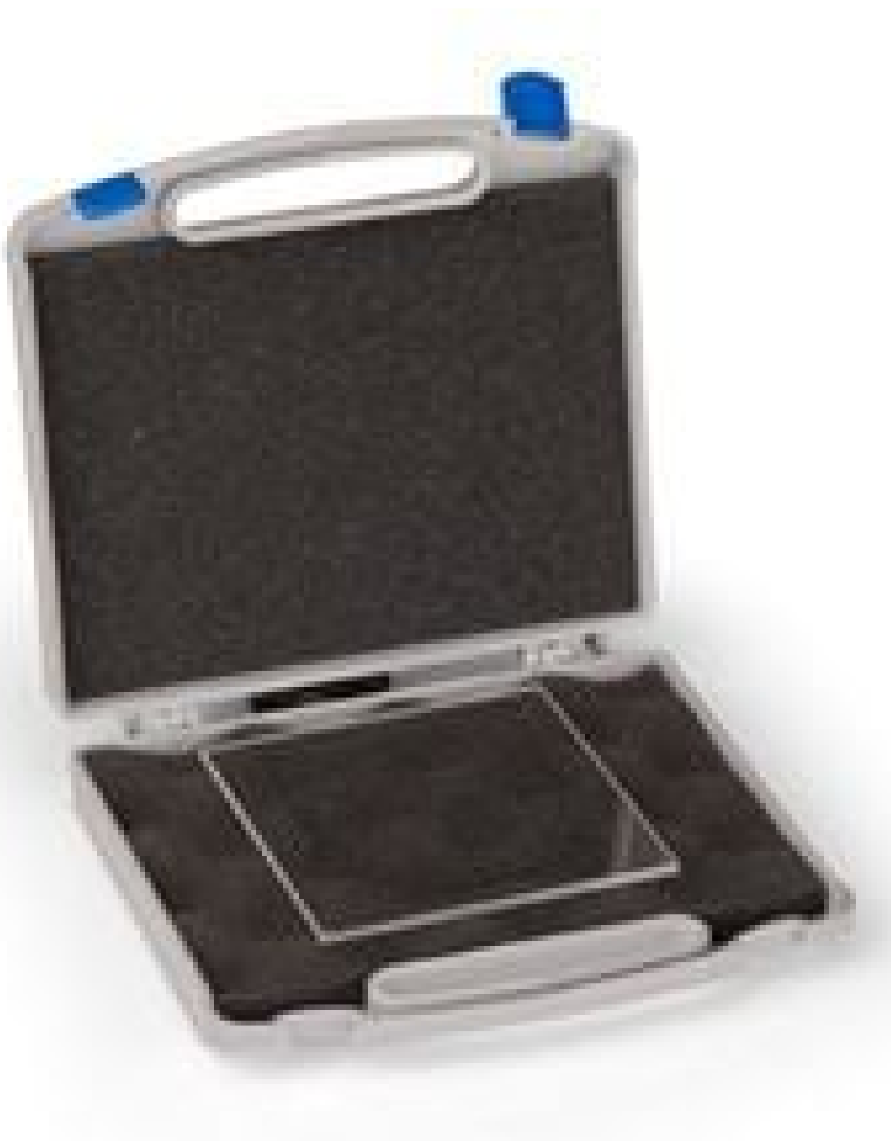
Particle Standard Target