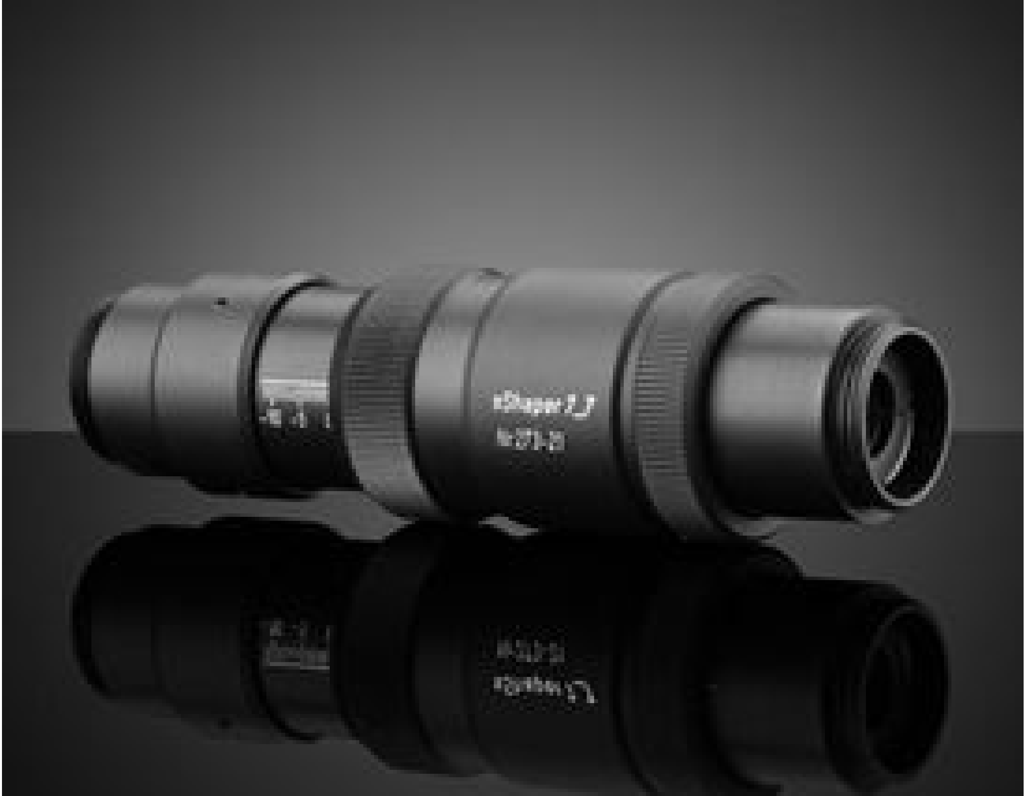
#25-838: 9.4µm Flat Top Beam Shaper | πShaper 7_7_9.4