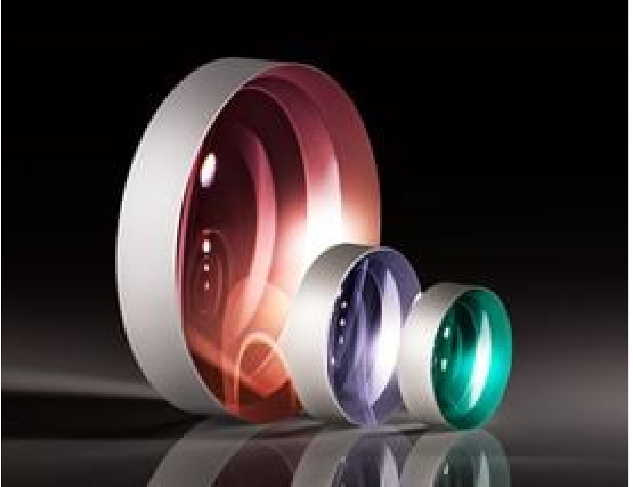
TECHSPEC Uncoated Plano-Concave (PCV) Lenses