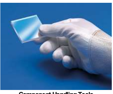
Component Handling Tools

These optics require special handling to avoid damage and ensure long-term performance. Proper handling, cleaning, and storage are essential to maintain optical quality. Explore our Optics Cleaning Resources for step-by-step guides and best practices. For personalized assistance, Email us or Chat with our technical support team.