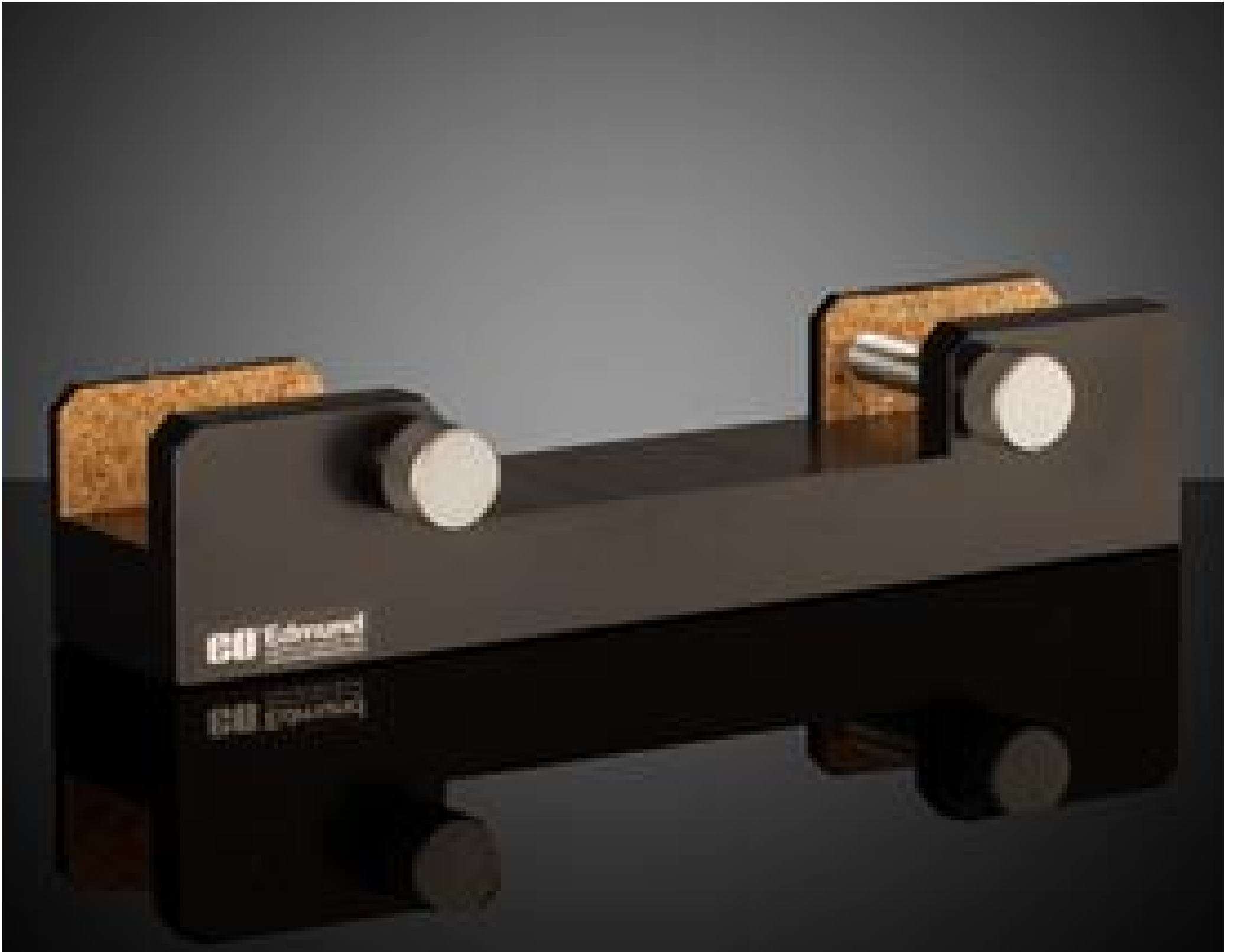
80mm Sq., Fixed Filter Holder