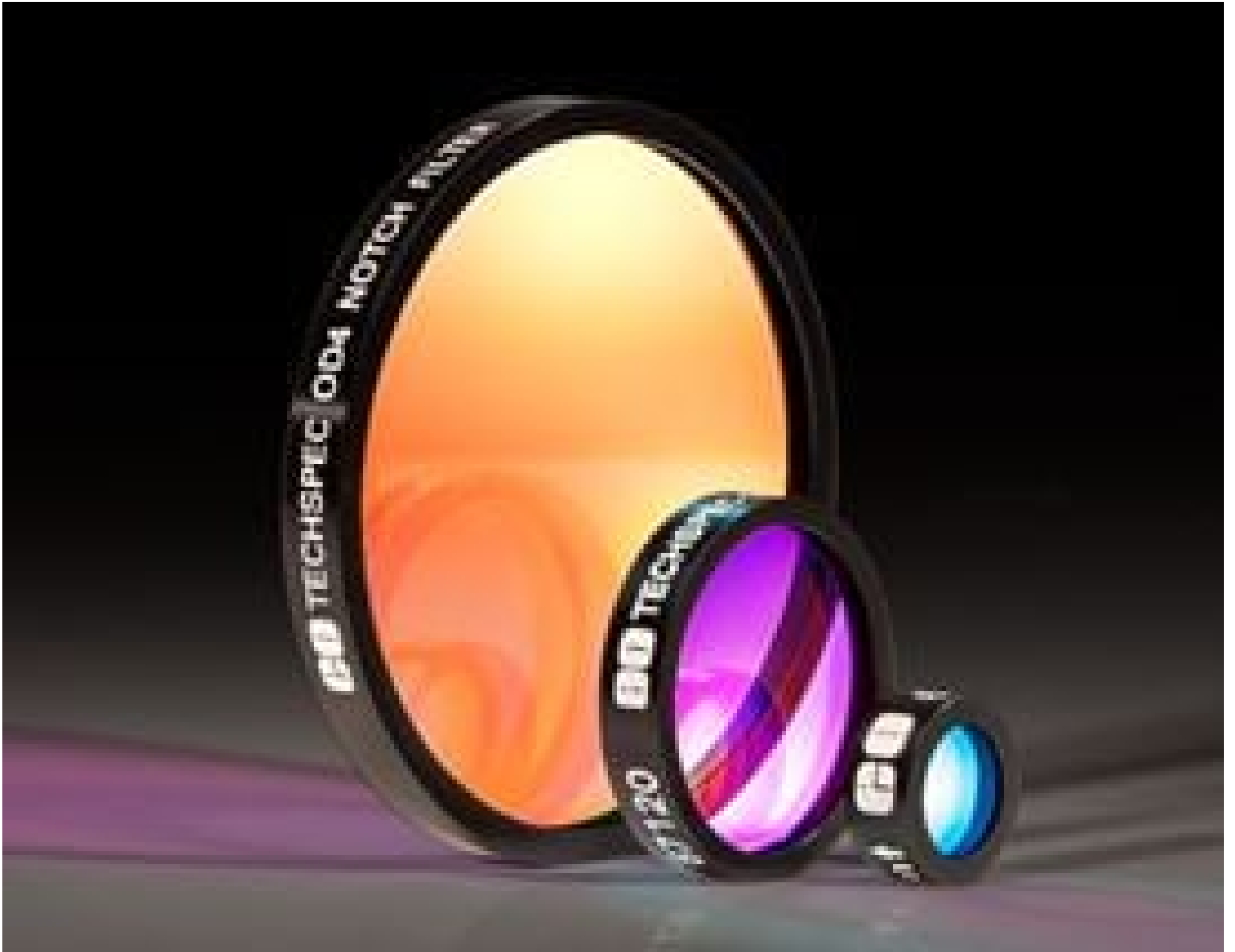
TECHSPEC OD 4.0 Notch Filters