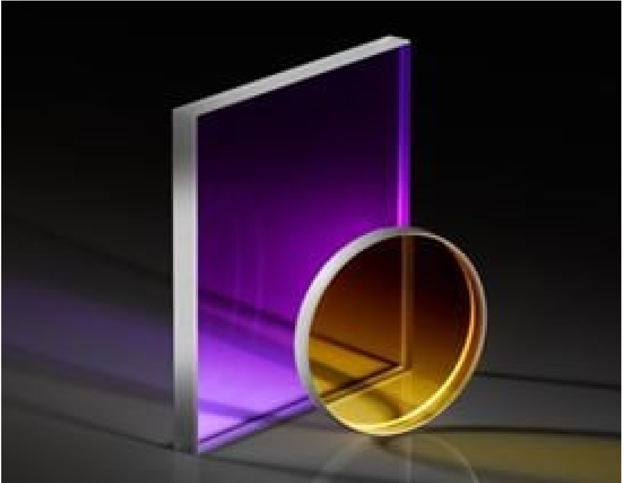
TECHSPEC® 1λ UV Fused Silica Windows