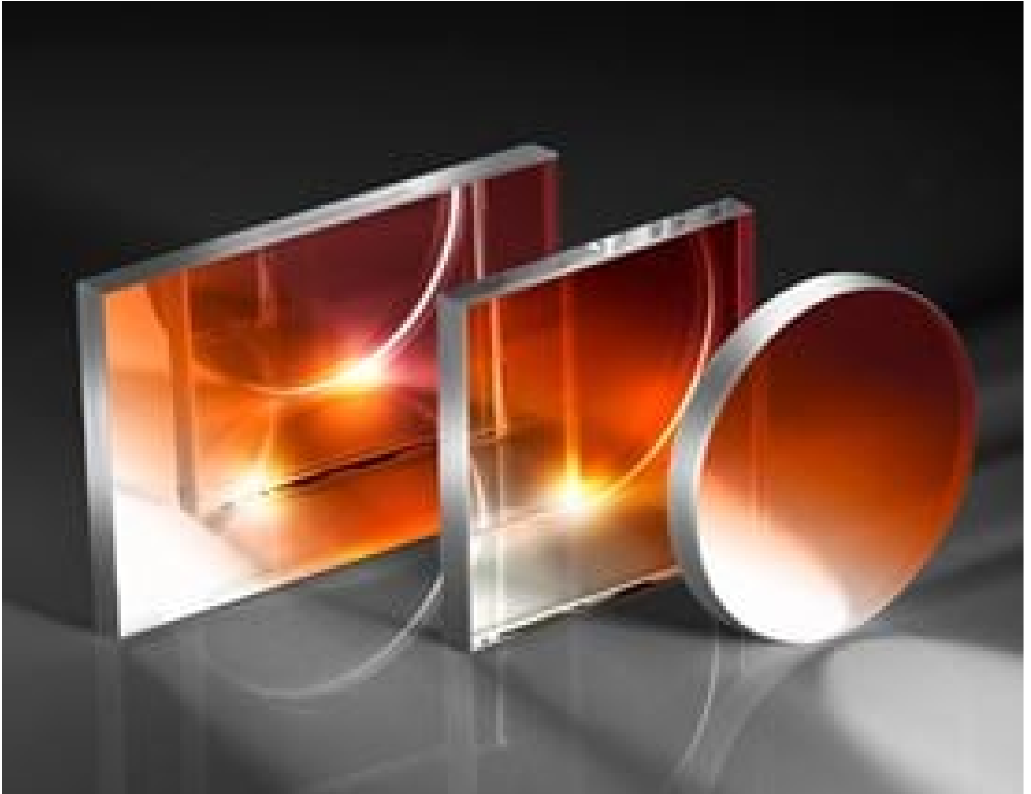
Visible and NIR Plate Beamsplitters