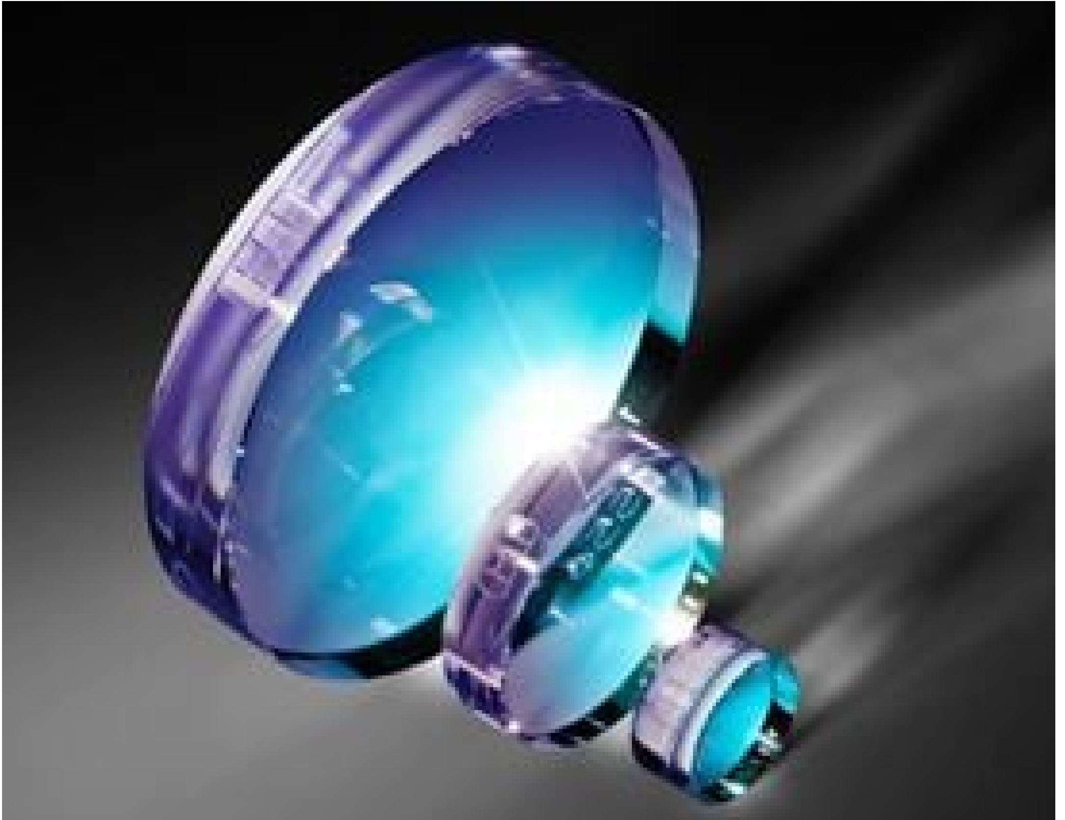
TECHSPEC® Superpolished Substrates