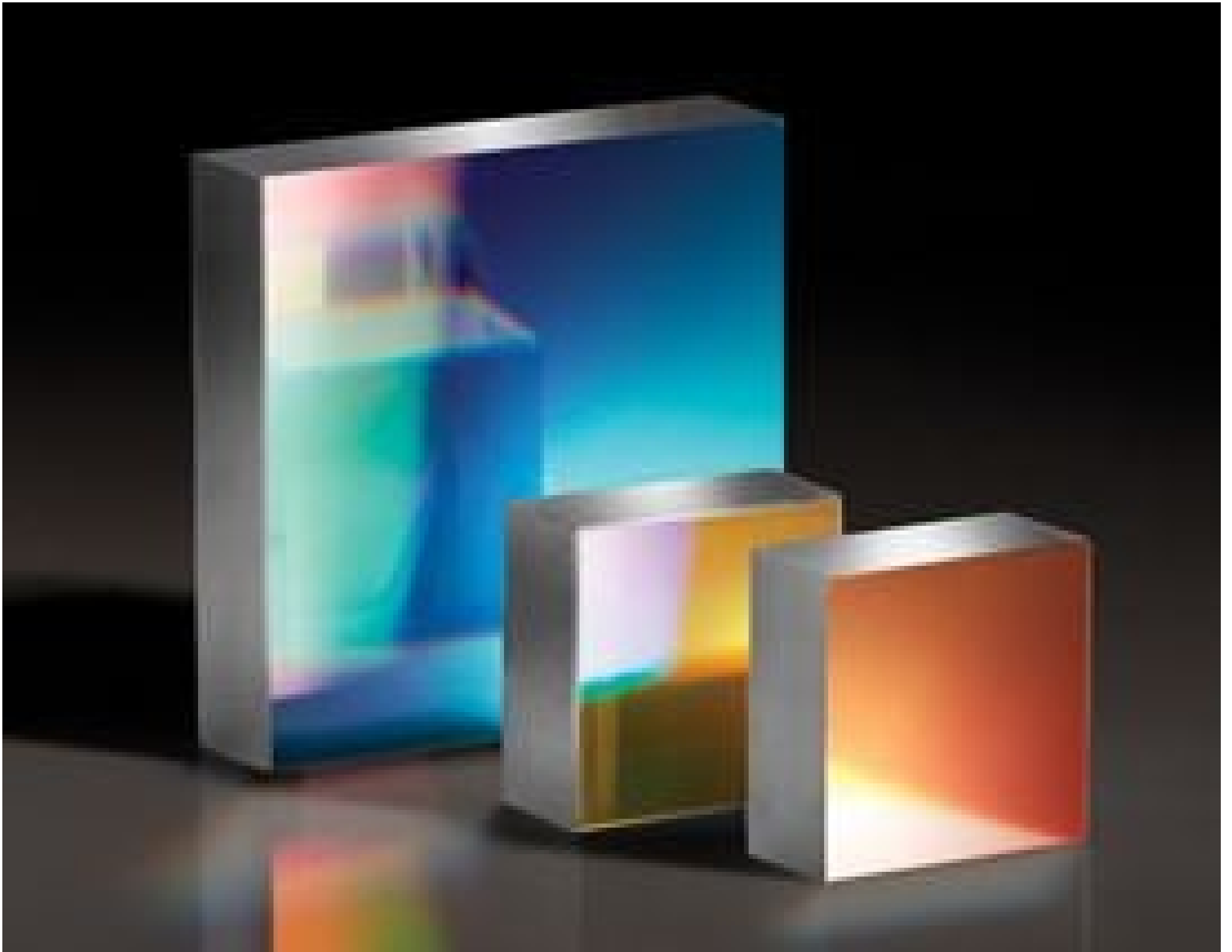
Richardson Gratings™ High Precision Plane Ruled Reflective Diffraction Gratings