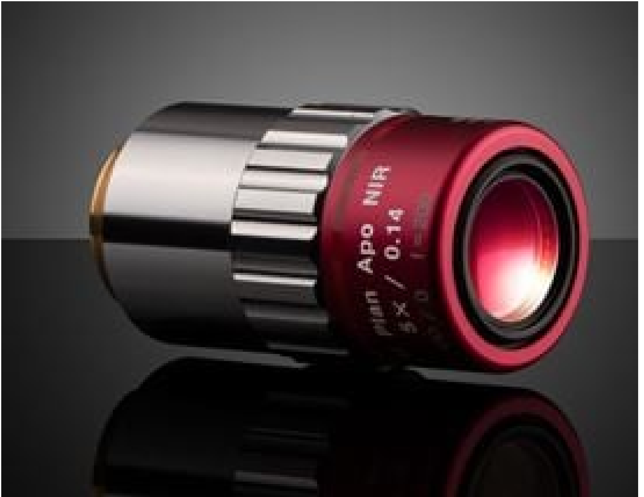
5X Mitutoyo Plan Apo NIR Infinity Corrected Objective, #46-402