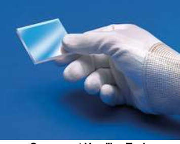
Component Handling Tools

our Optics Cleaning Resources for step-by-step guides and best practices. For personalized assistance, Email us or Chat with our technical support team.