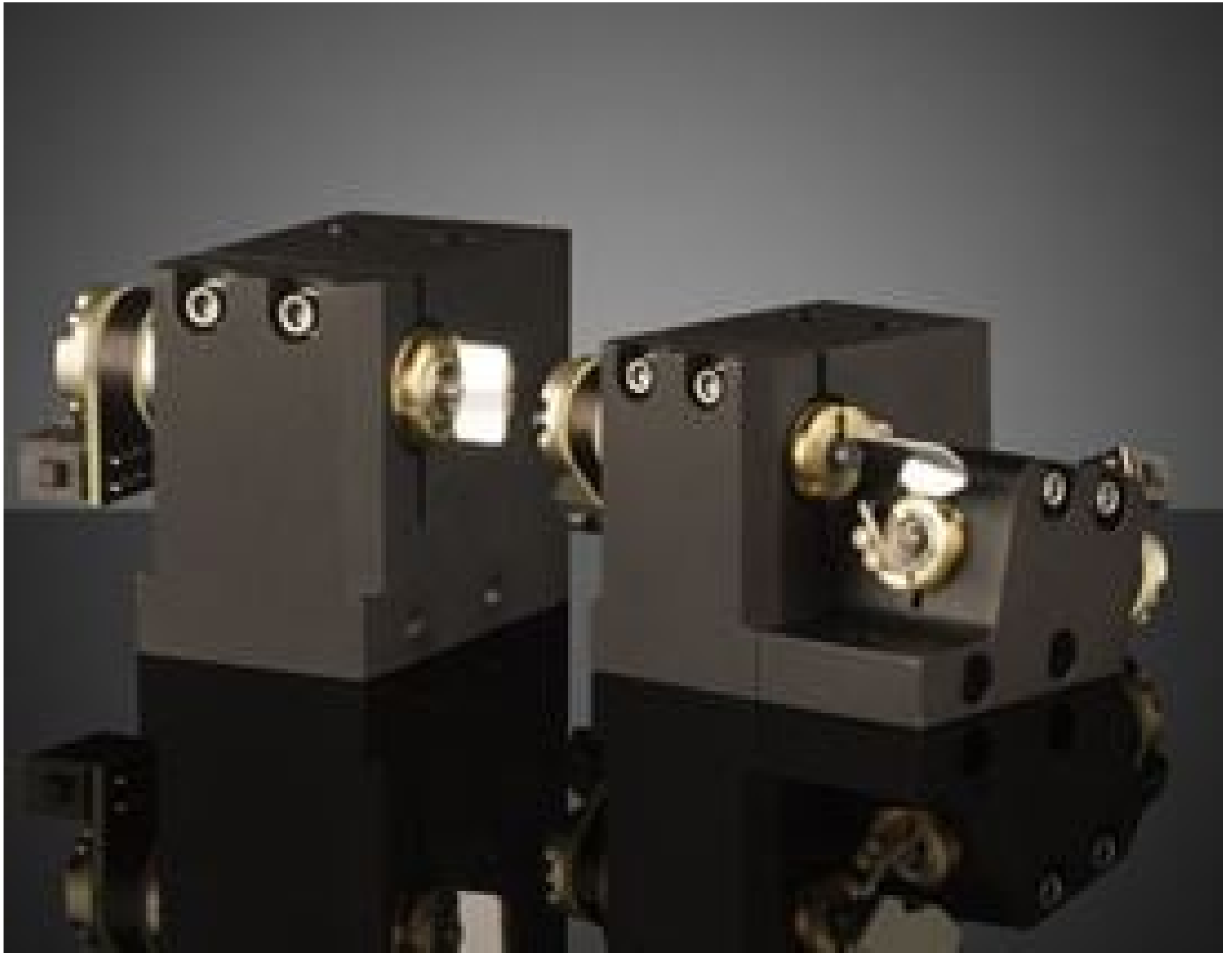
ScannerMAX Saturn Galvanometer Optical Scanners