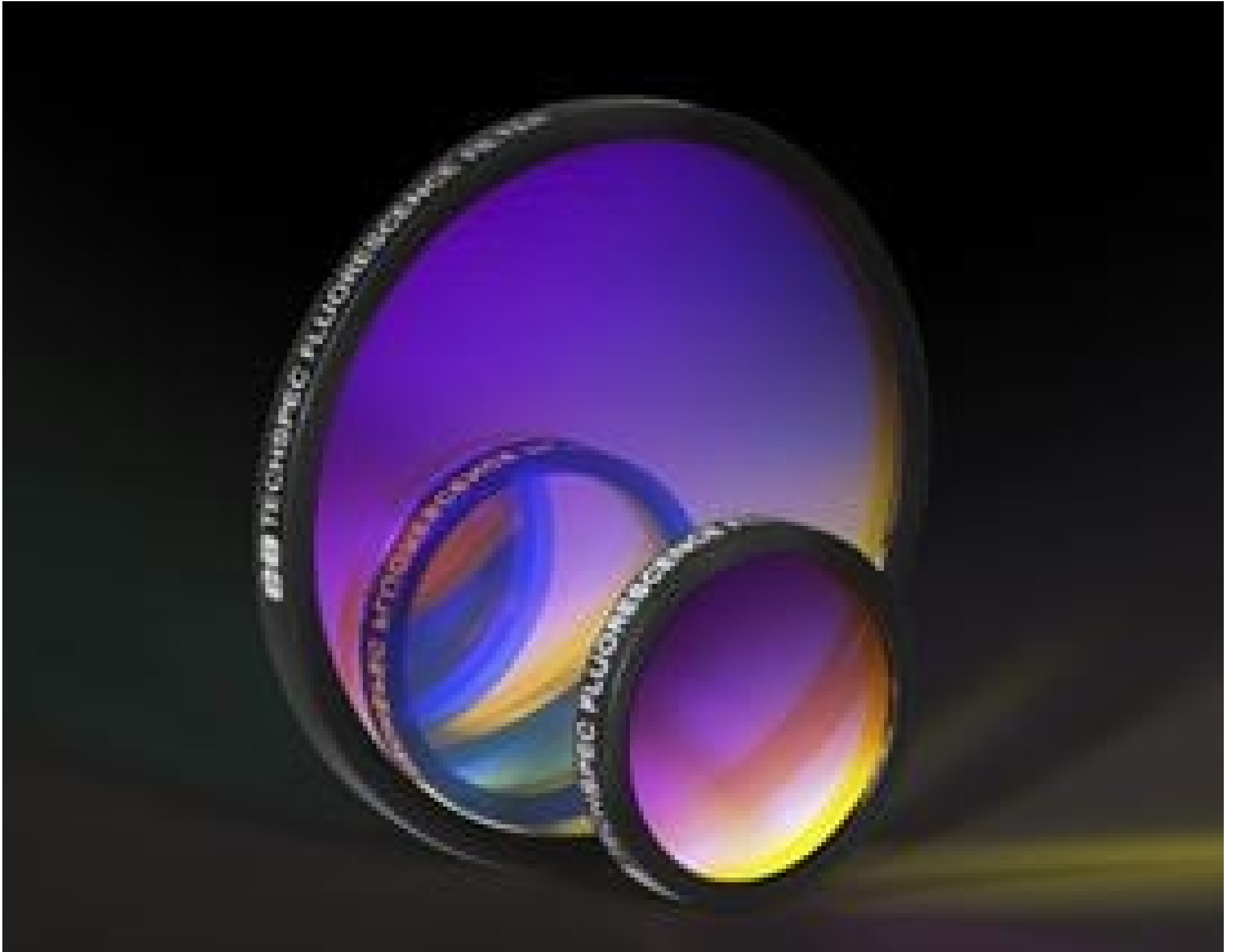
Multi-Band Fluorescence Bandpass Filters