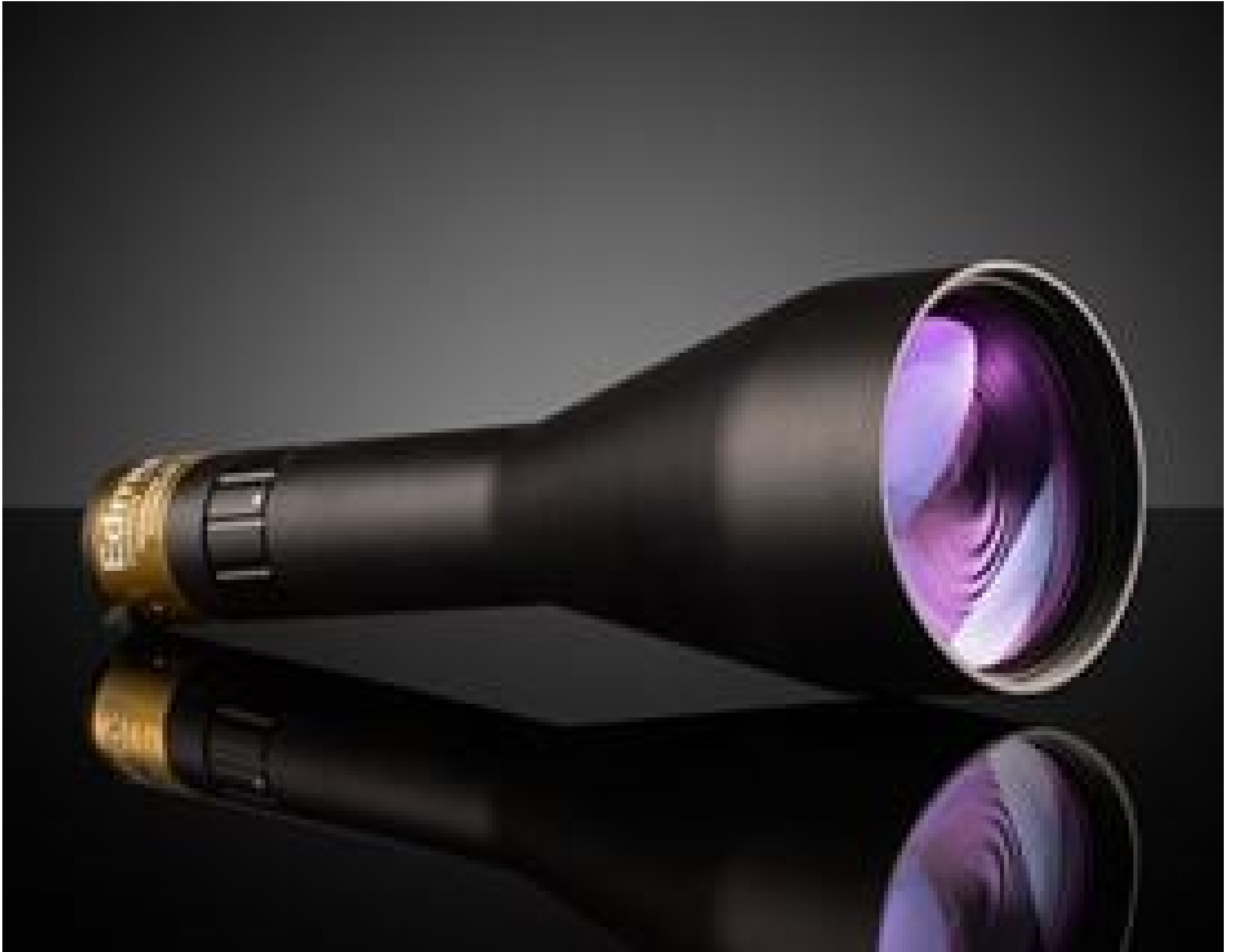
52mm Telecentric Backlight Illuminator, #62-760