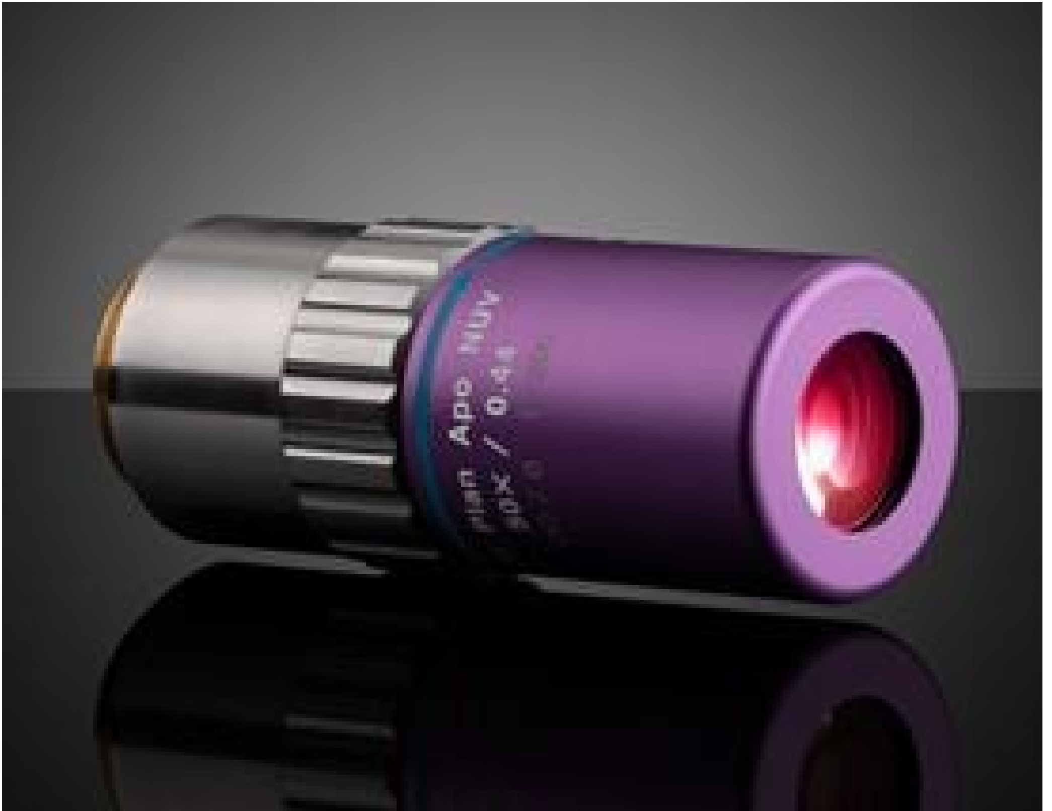
50X Mitutoyo Plan Apo NUV Infinity Corrected Objective, #46-408