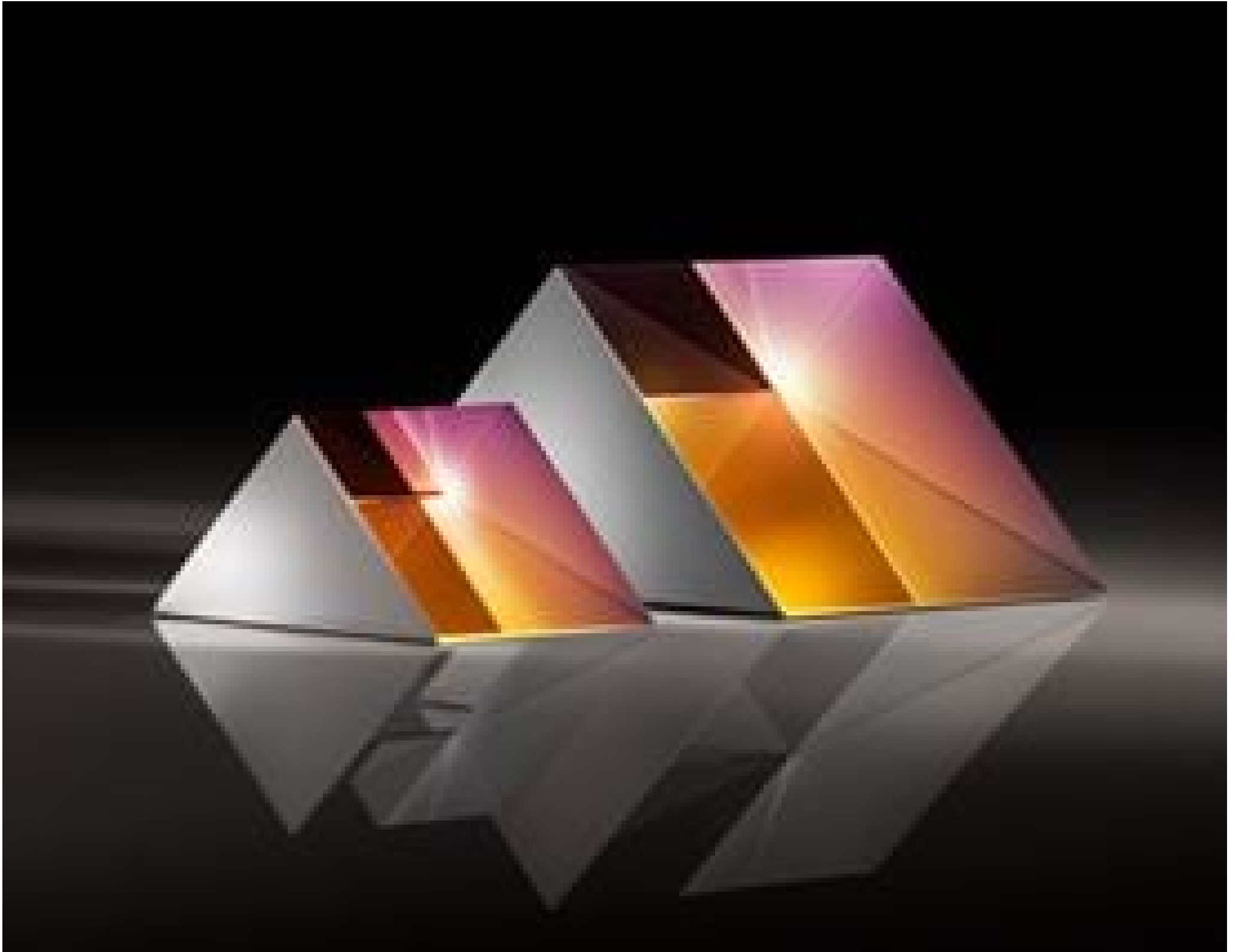
TECHSPEC UV Fused Silica Right Angle Prisms