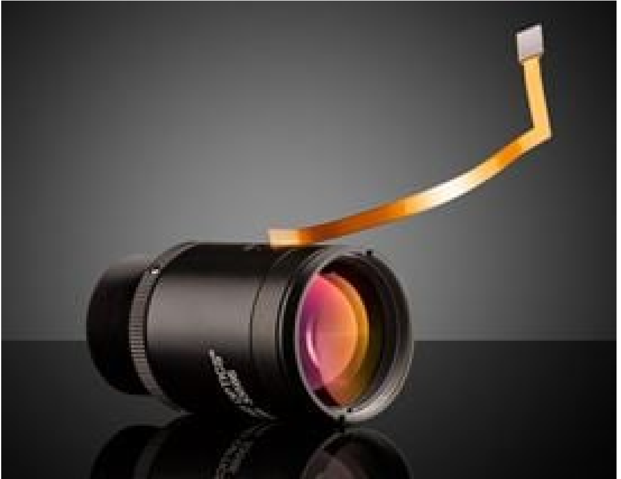
50mm, f/7, Liquid Lens Cx Series Fixed Focal Length Lens, #33-687