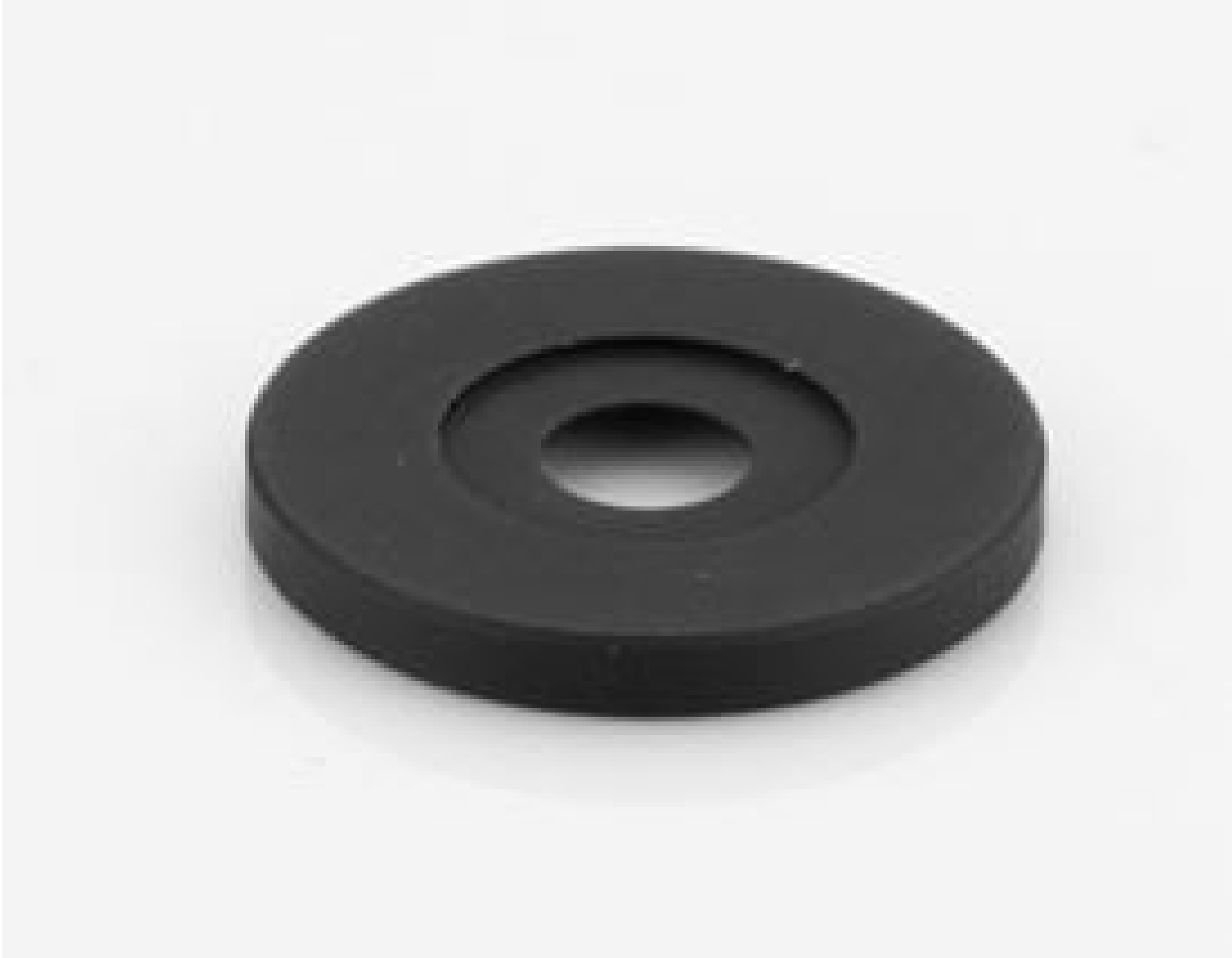
Aperture for Cx Lens (representative photo). Aperture varies by stock number. View PDF drawing for additional information.