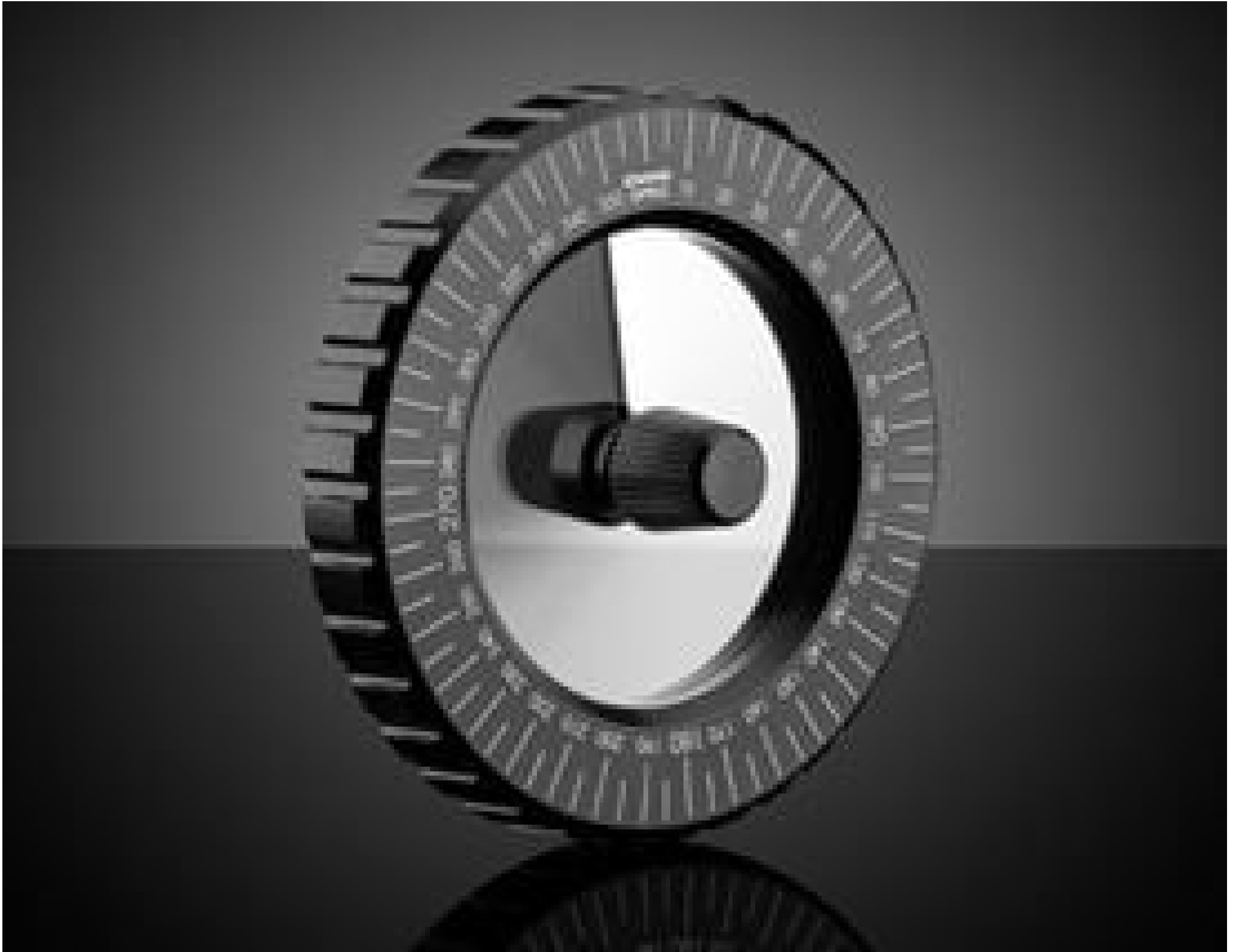
Mounted Circular Variable Neutral Density (ND) Filters