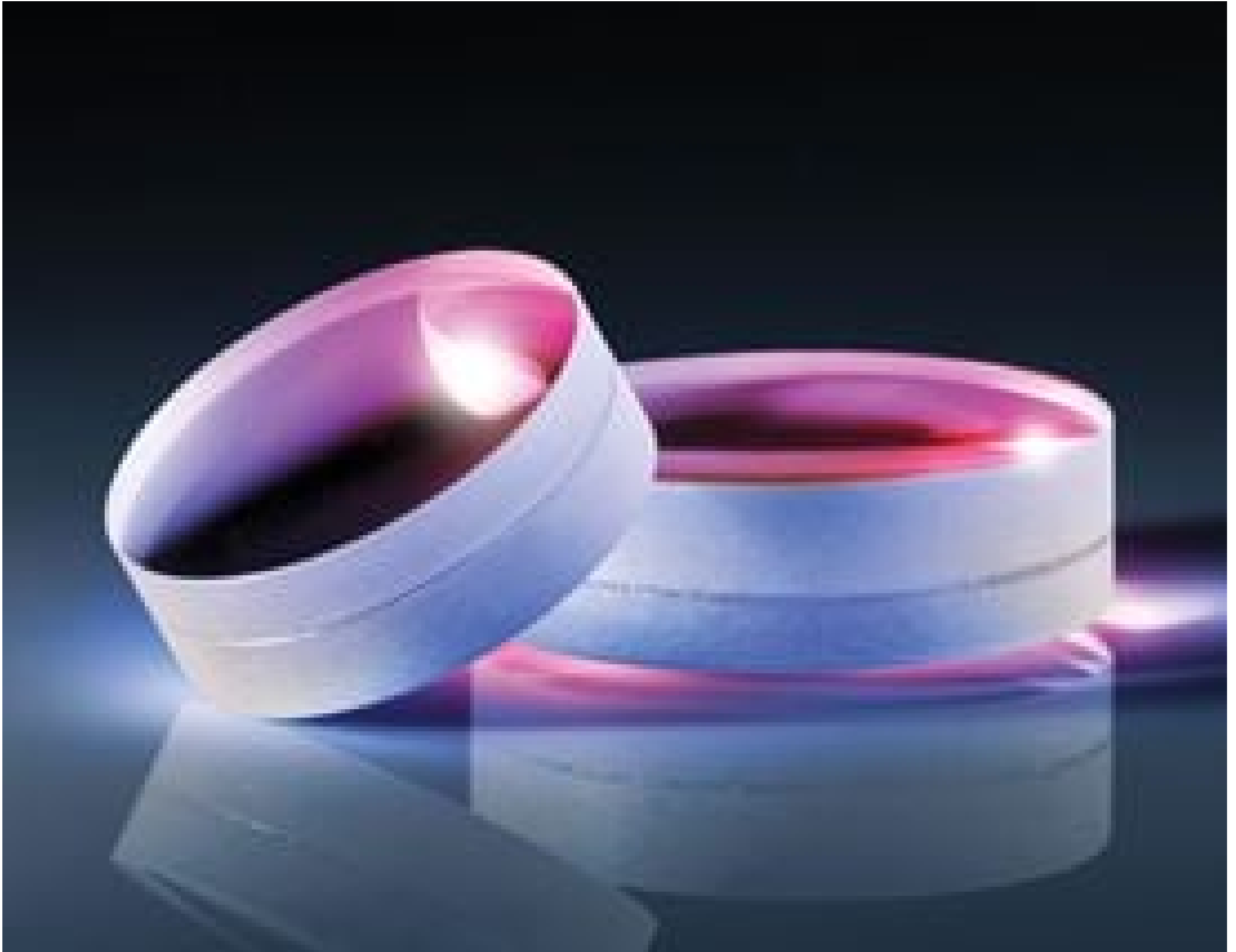
MgF 2 Coated Achromatic Lenses