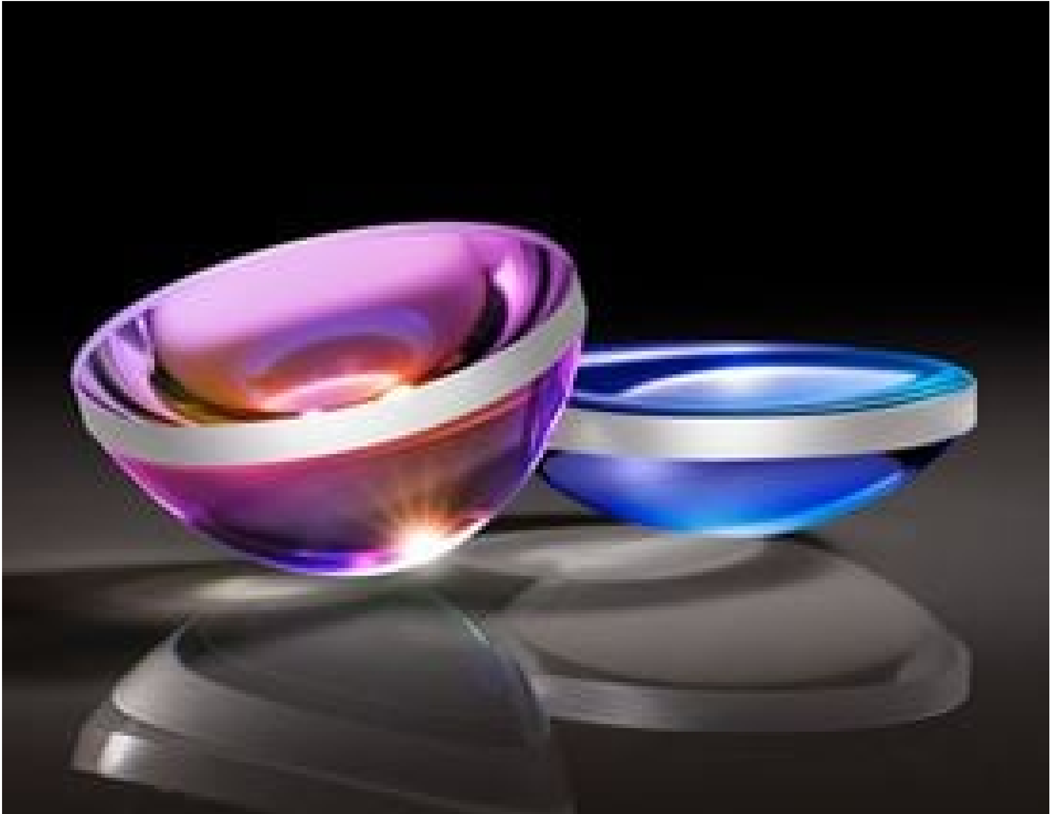
TECHSPEC UV Fused Silica Aspheric Lenses