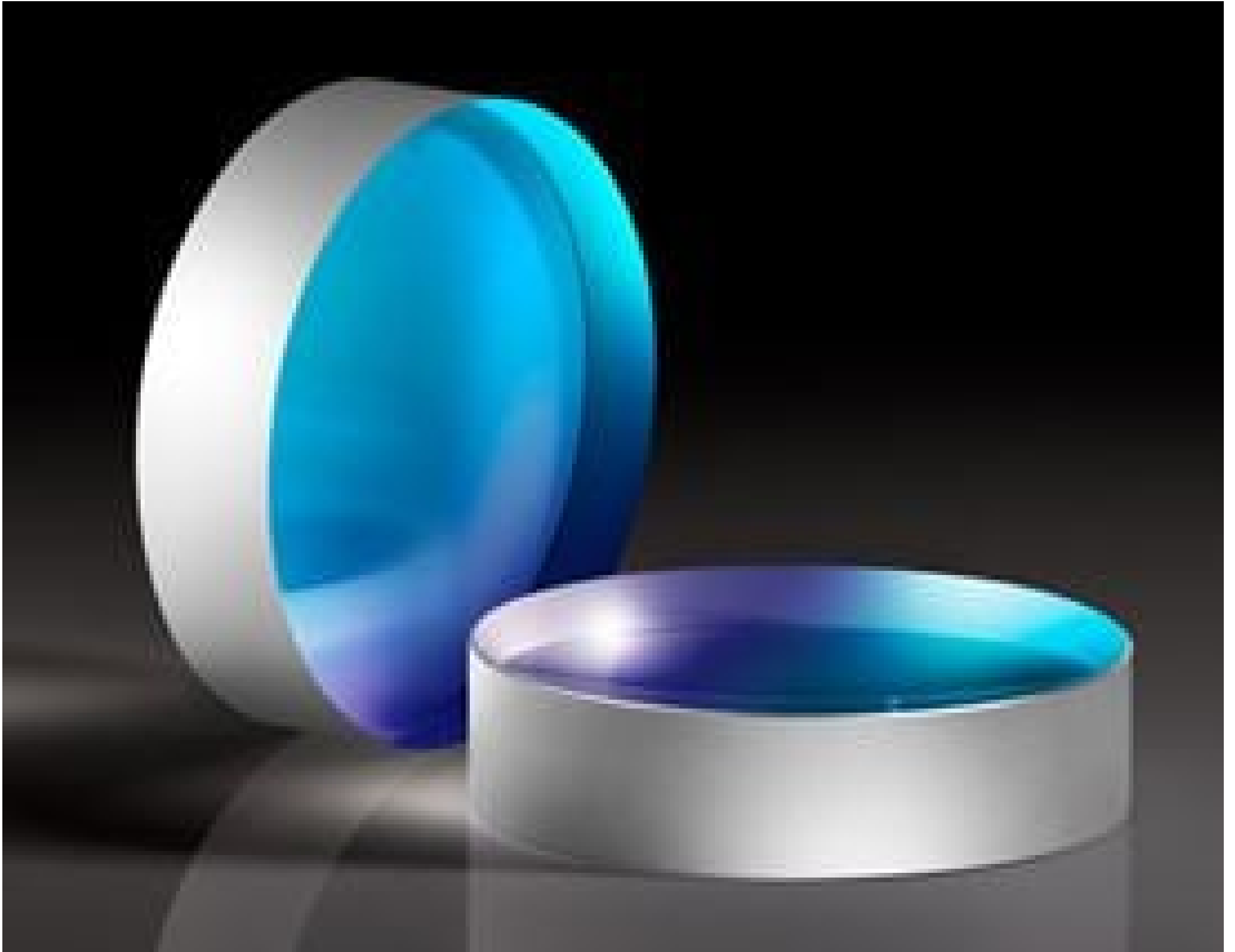
Laser Line Concave Mirrors