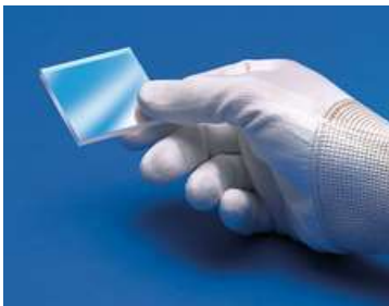
Component Handling Tools

These optics require special handling to avoid damage and ensure long-term performance. Proper handling, cleaning, and storage are essential to maintain optical quality. Explore our Optics Cleaning Resources for step-by-step guides and best practices. For personalized assistance, Email us or Chat with our technical support team.