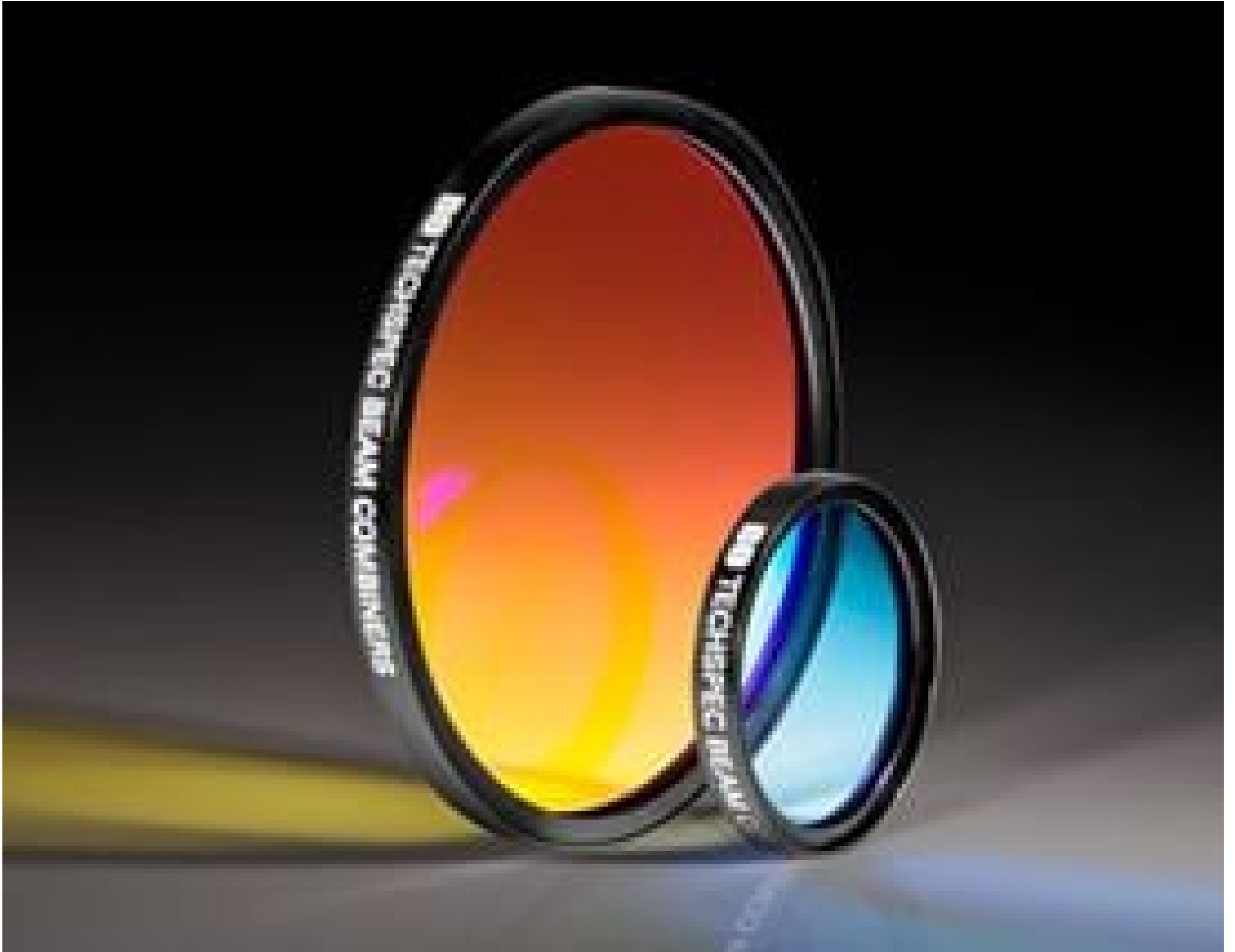
TECHSPEC® Dichroic Laser Beam Combiners