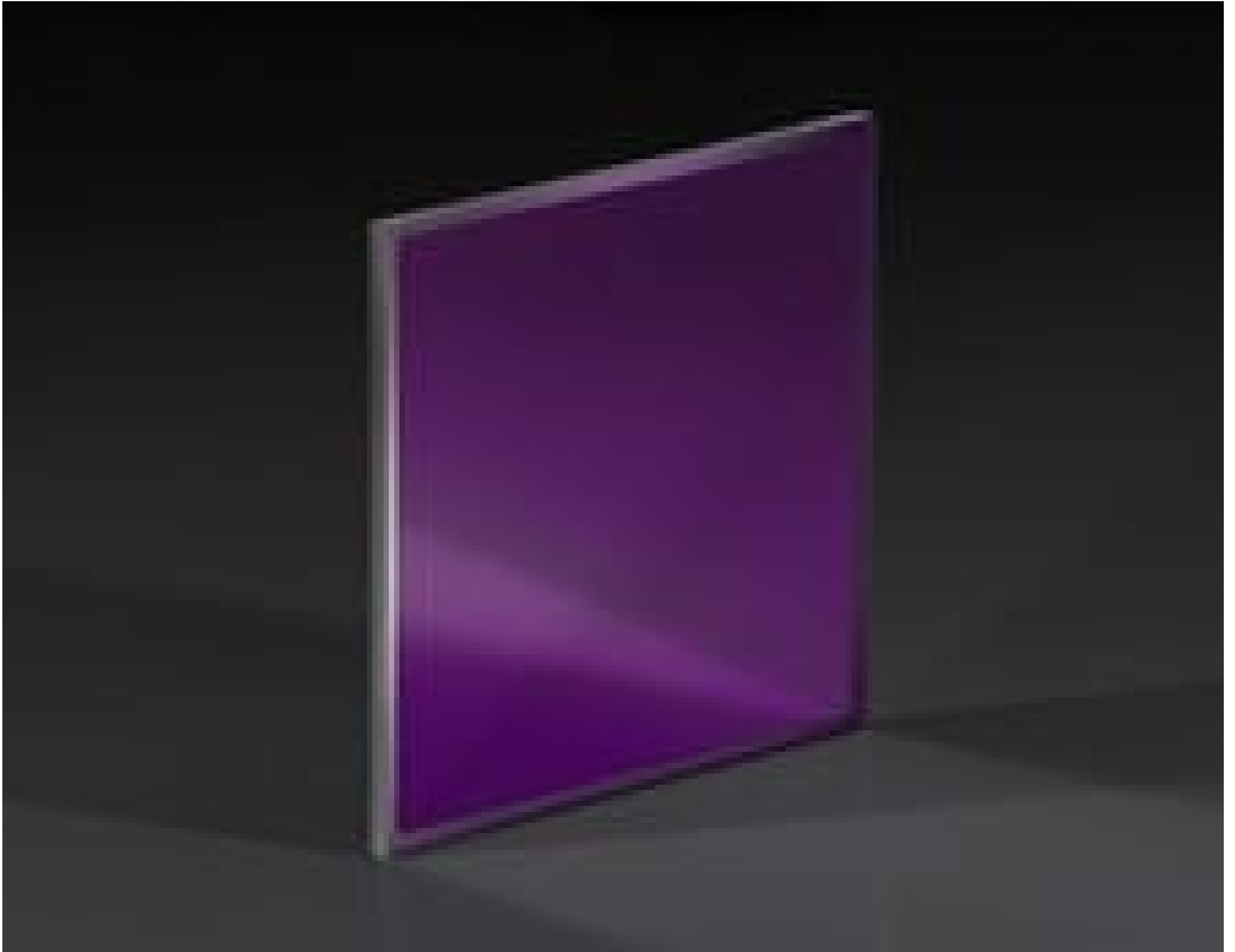
Unmounted Ultra Broadband Wire Grid Linear Polarizer