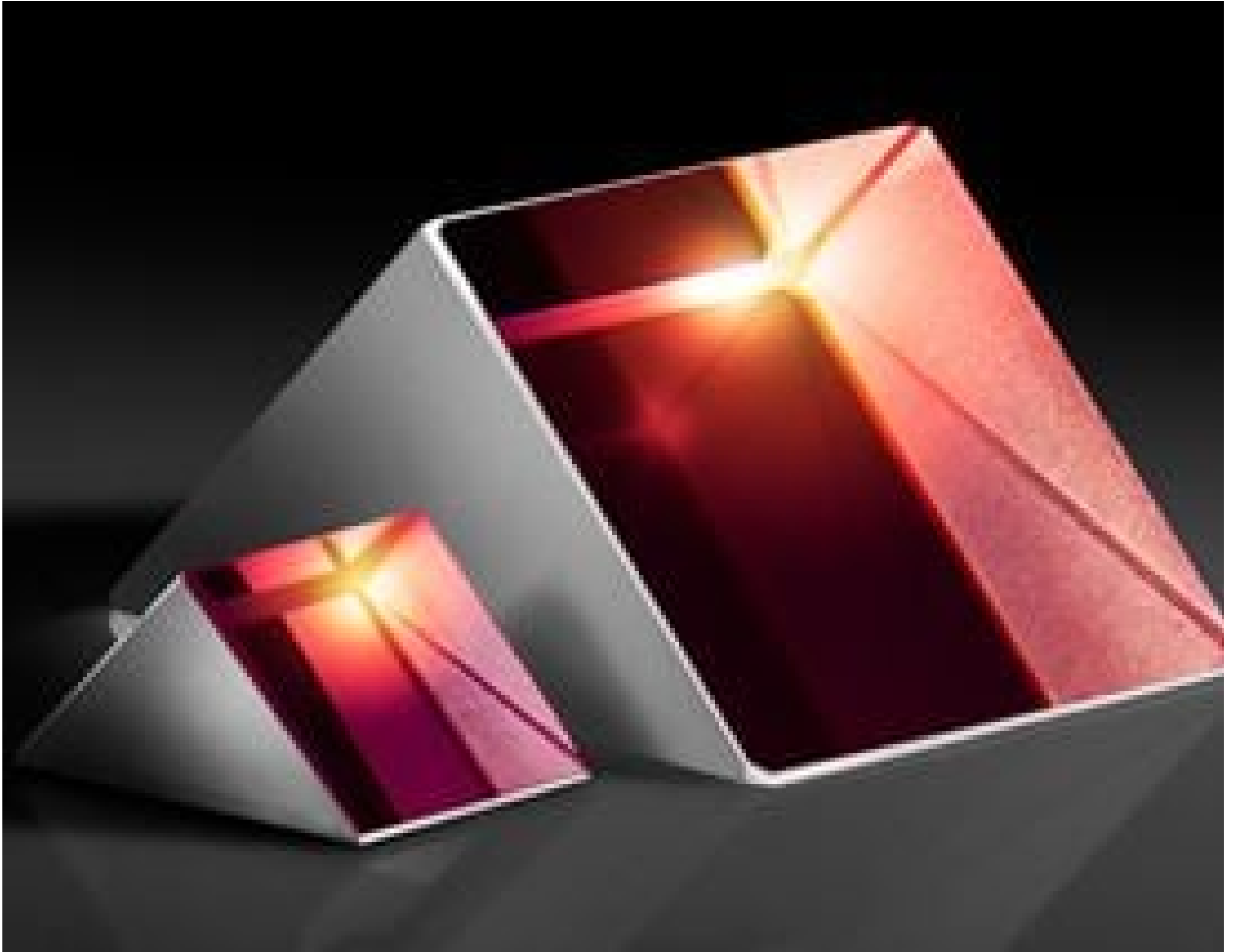
N-SF11 Right Angle Prisms