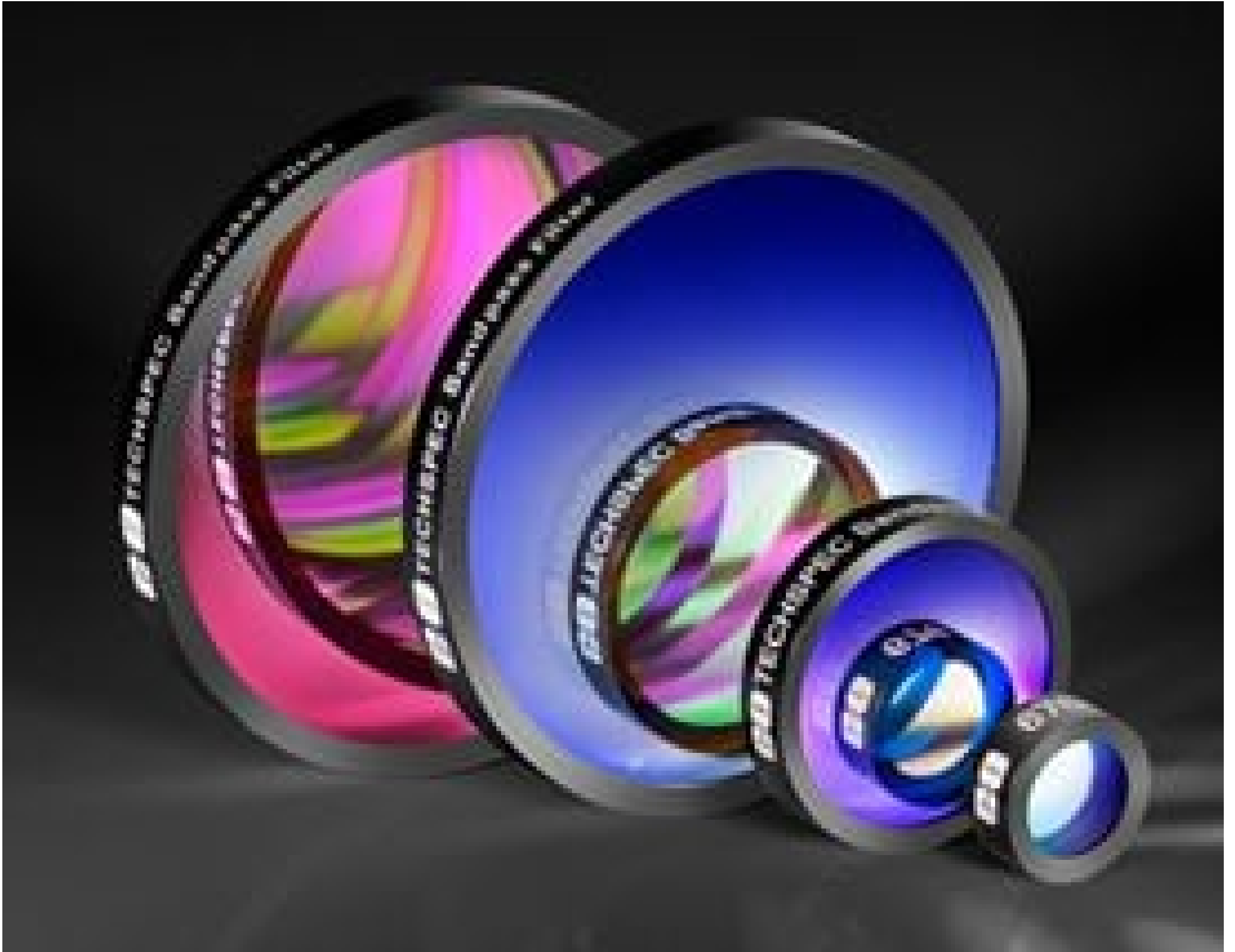
TECHSPEC Hard Coated OD 4.0 10nm Bandpass Filters