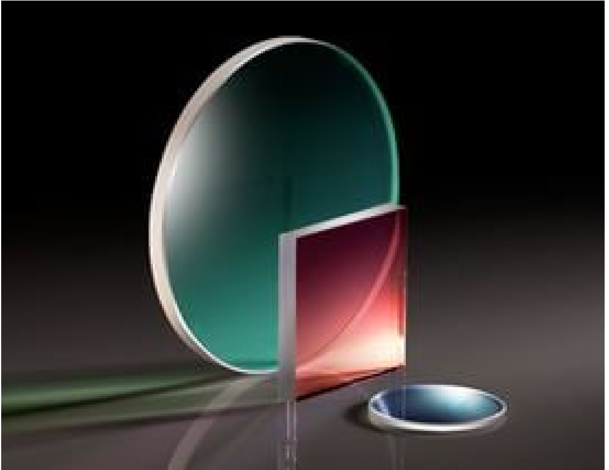
TECHSPEC High Performance Hot Mirrors