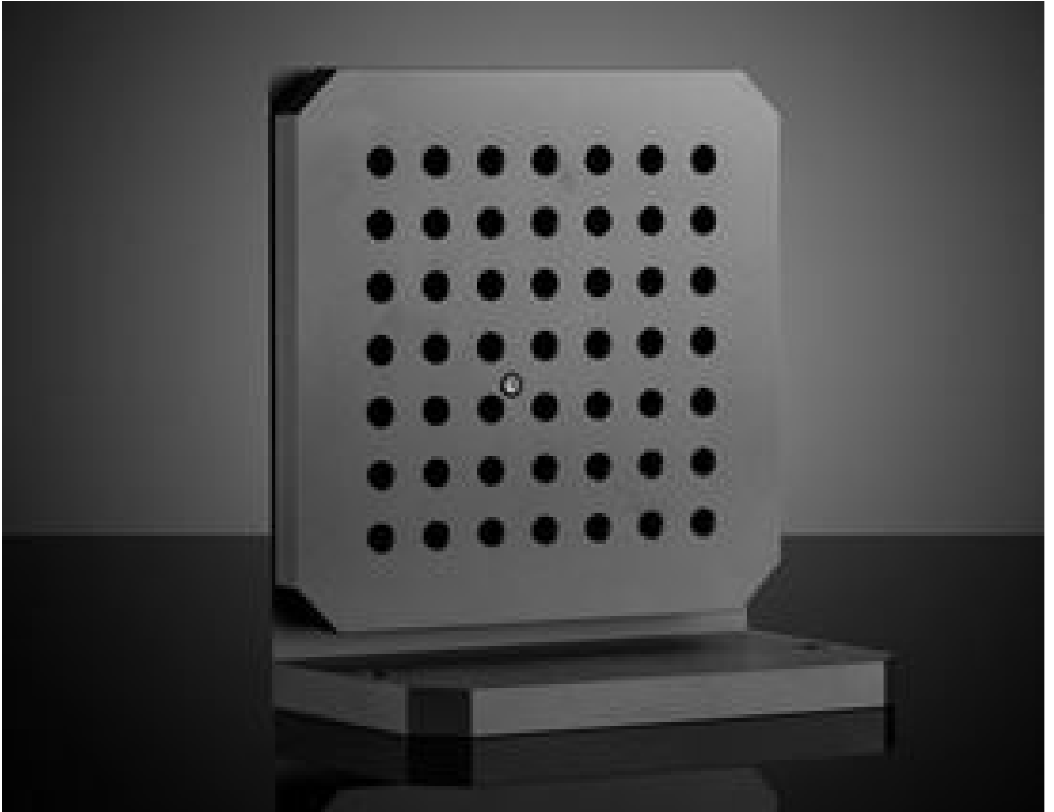
4.5" Angle Mirror Mount