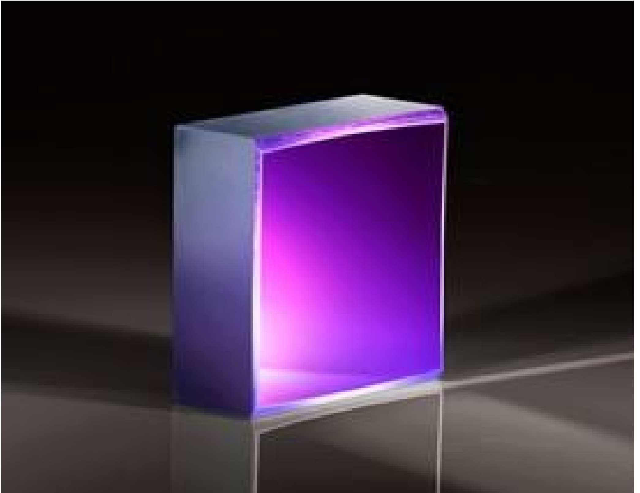
High Performance Off-Axis Parabolic Mirrors