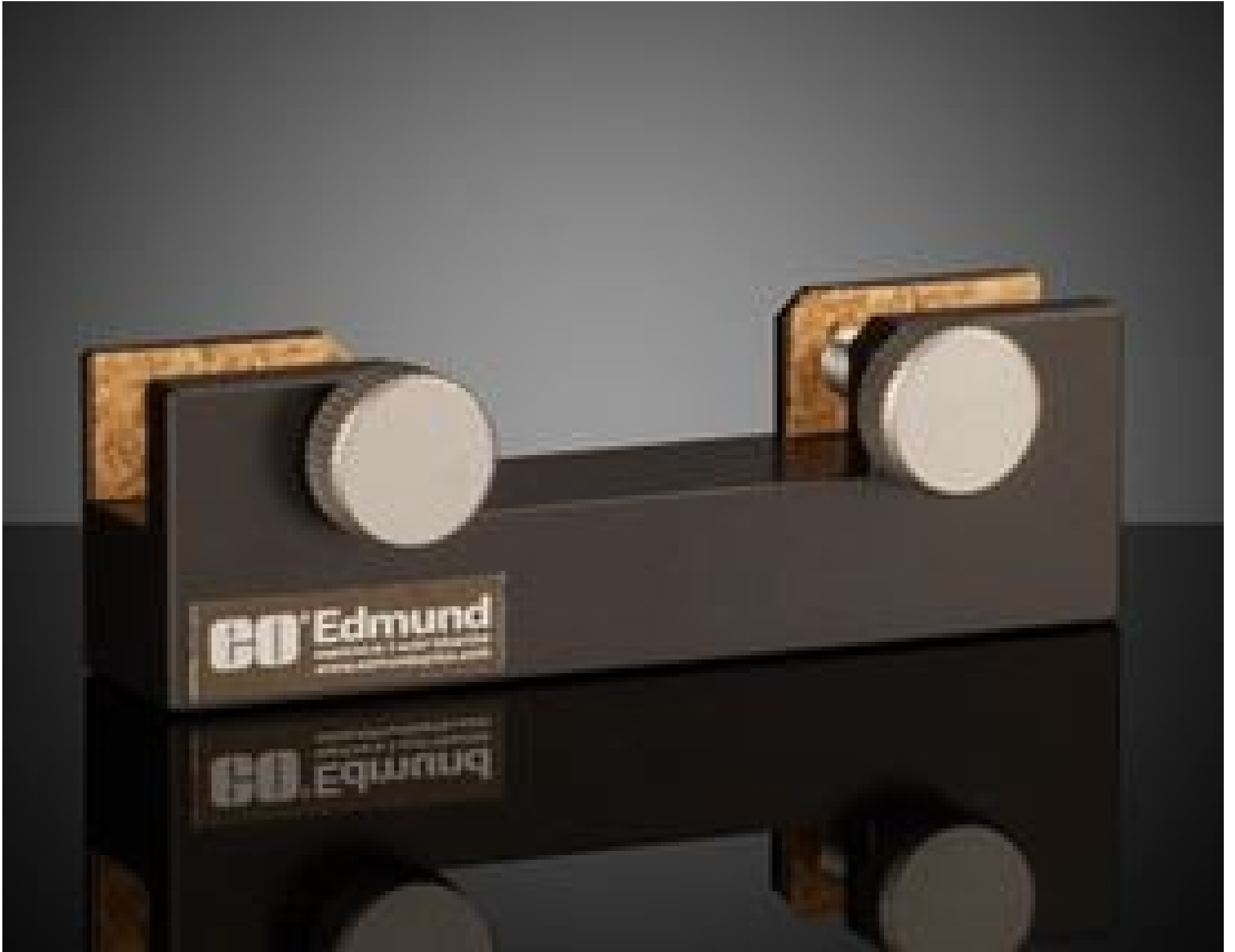
40mm Sq., Fixed Filter Holder