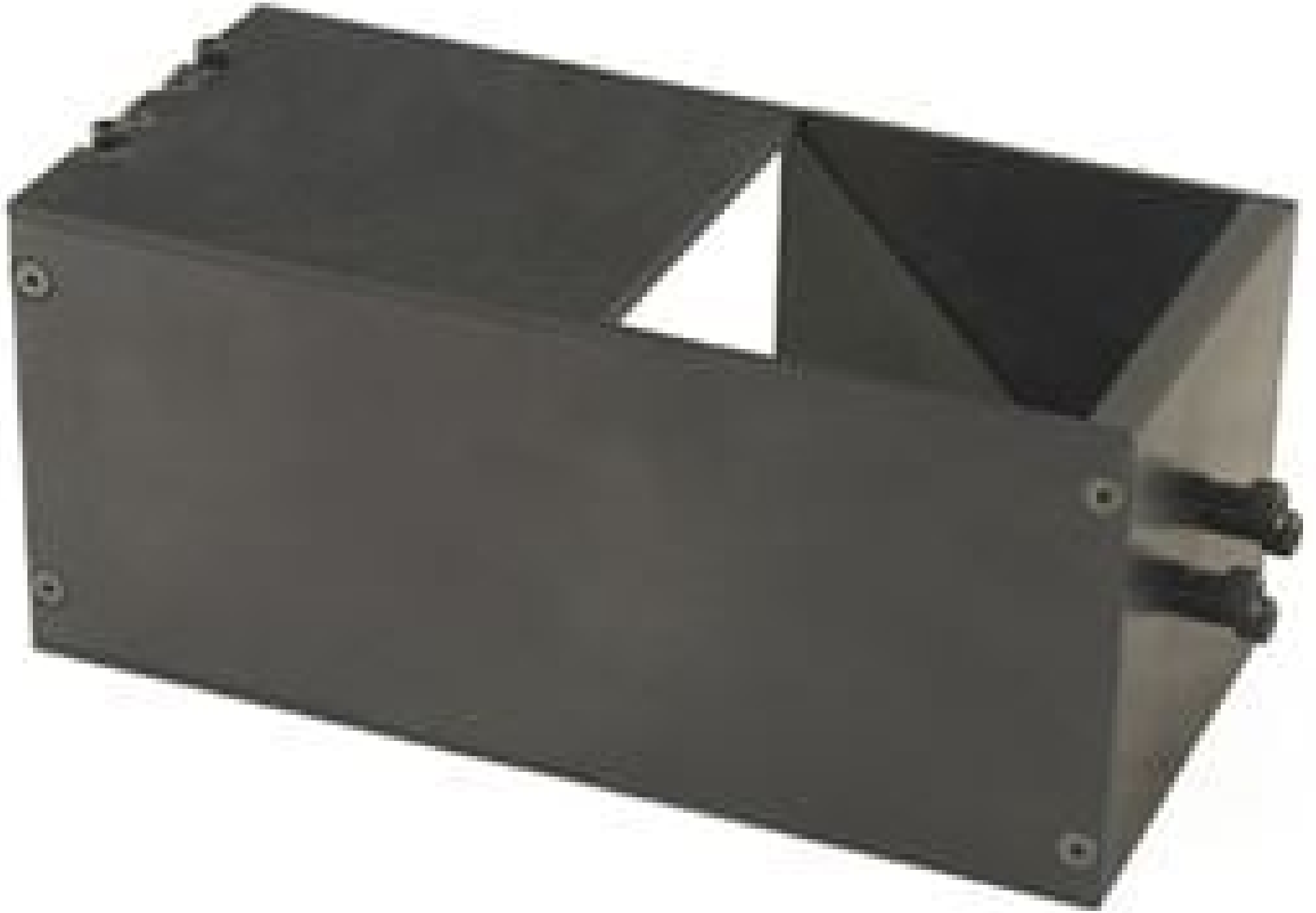
4" Fiber Optic Diffuse Axial Illuminators (#53-381)