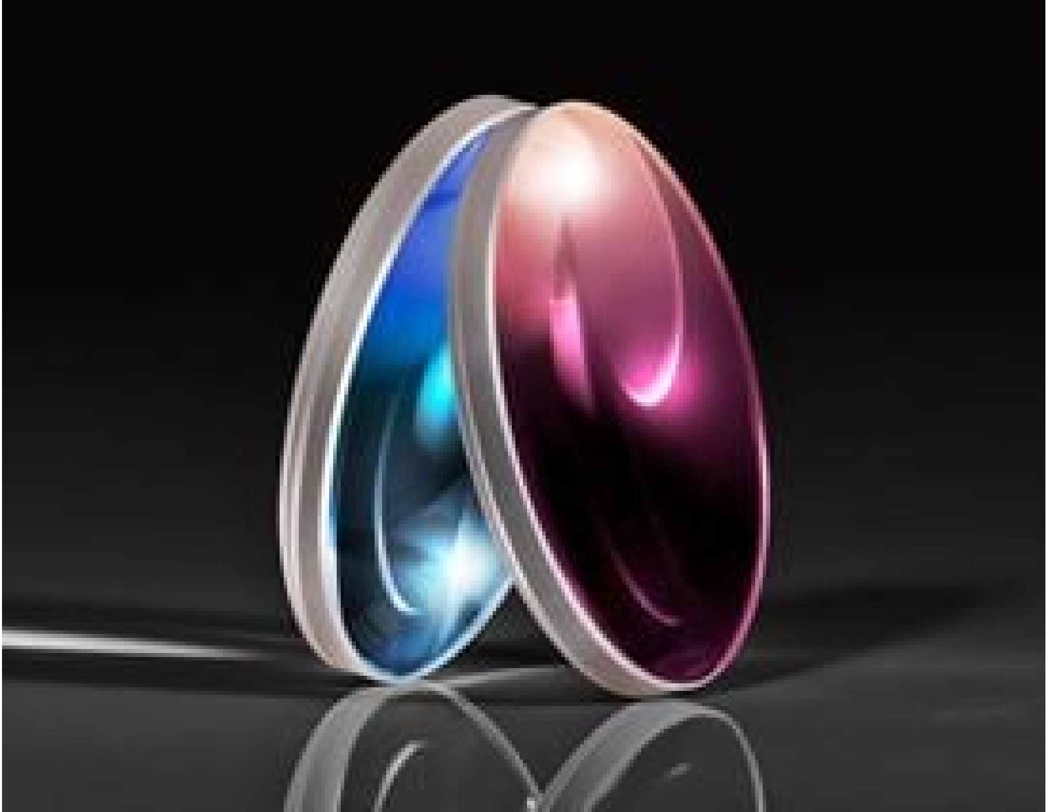
Calcium Fluoride Double-Convex (DCX) Lenses