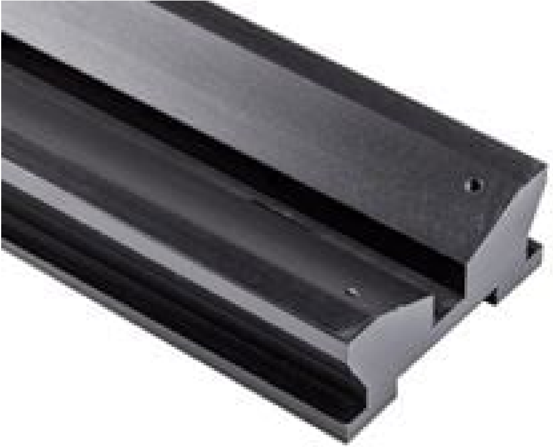
36" Length, Dovetail Optical Rail, #54-402