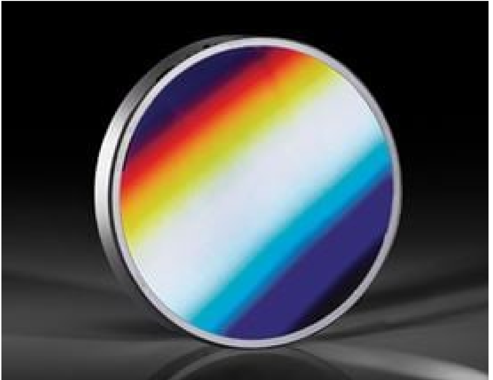
ZEISS Concave Diffraction Gratings