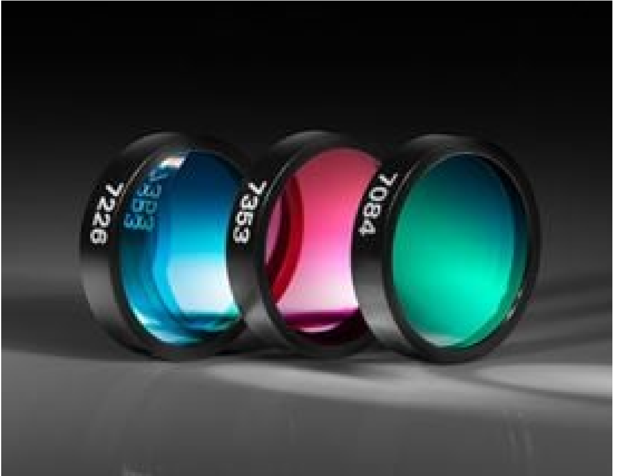
Ultra Narrow Bandpass Filters