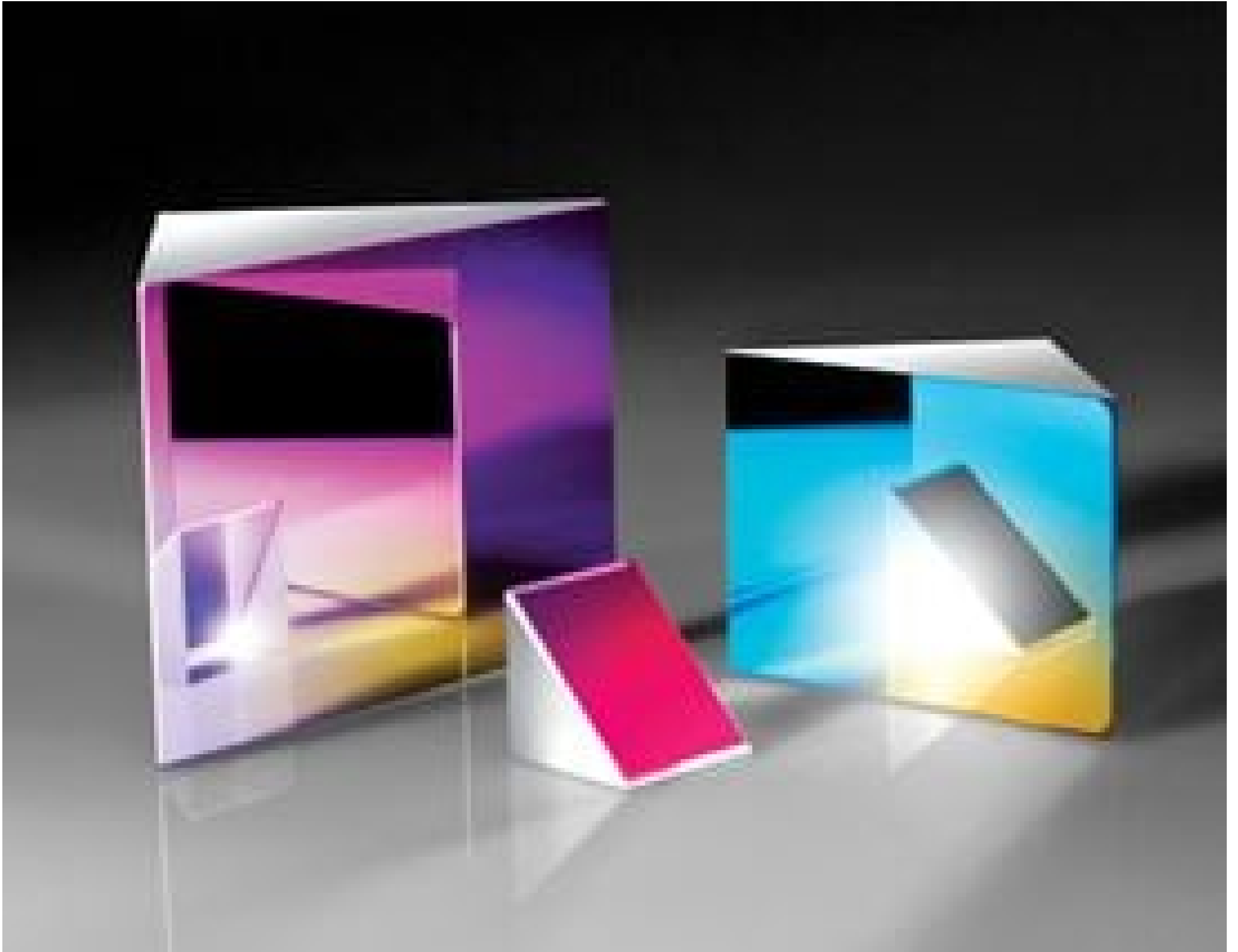
Broadband Dielectric Coated Right Angle Mirrors