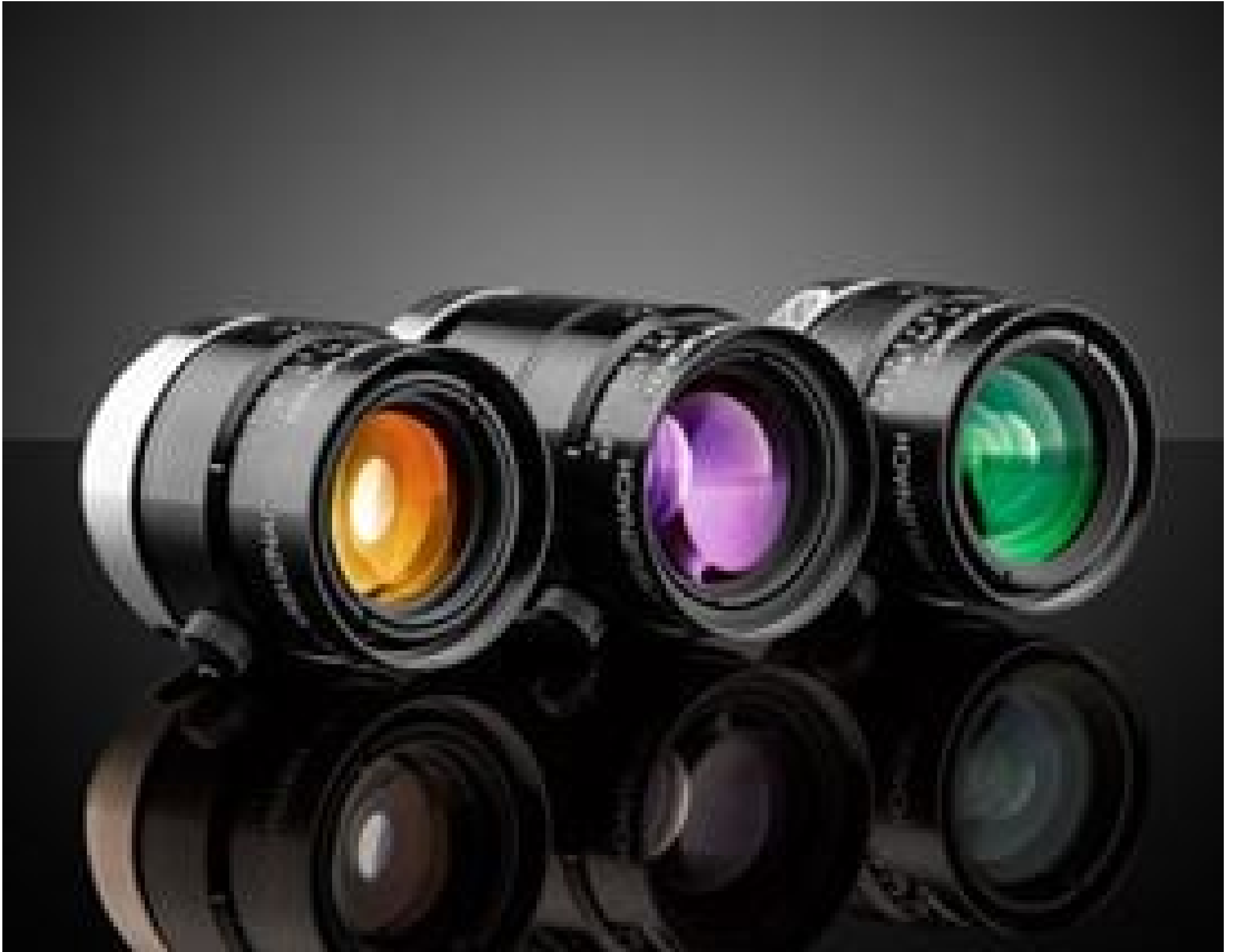
Schneider Compact VIS-NIR Lenses