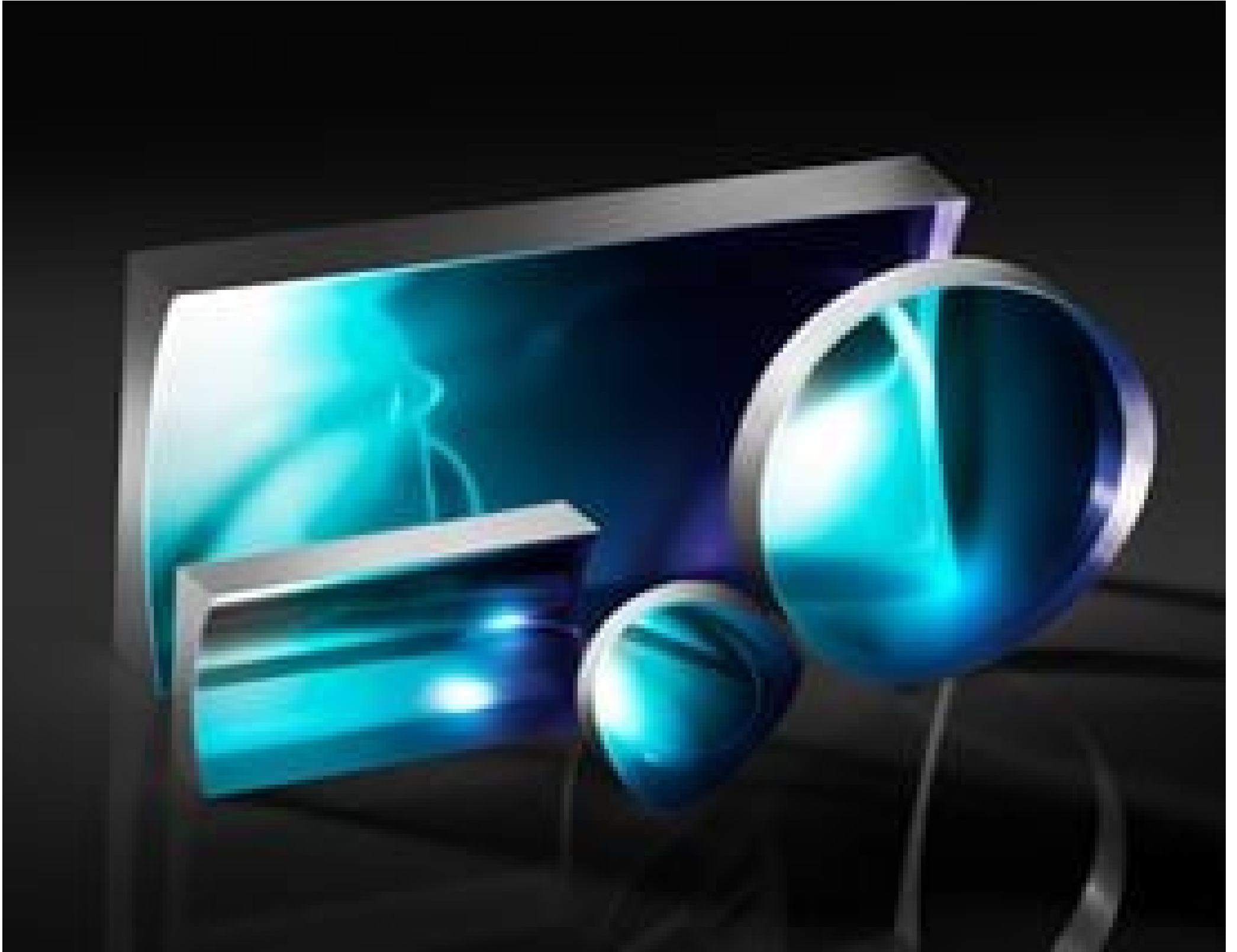
TECHSPEC® Illumination Grade PCV Cylinder Lenses