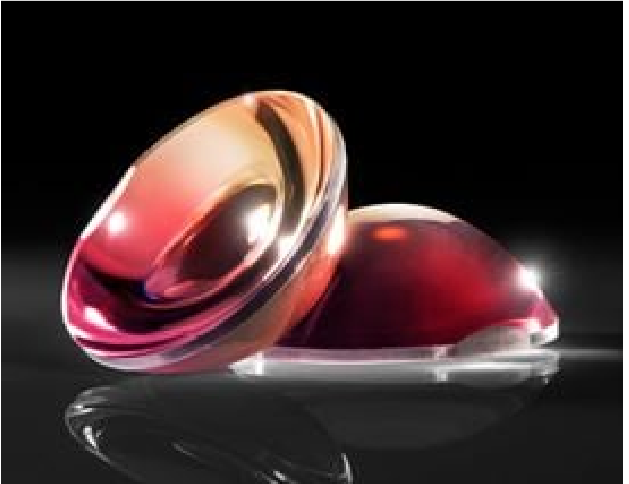
TECHSPEC® Plastic Aspheric Lenses