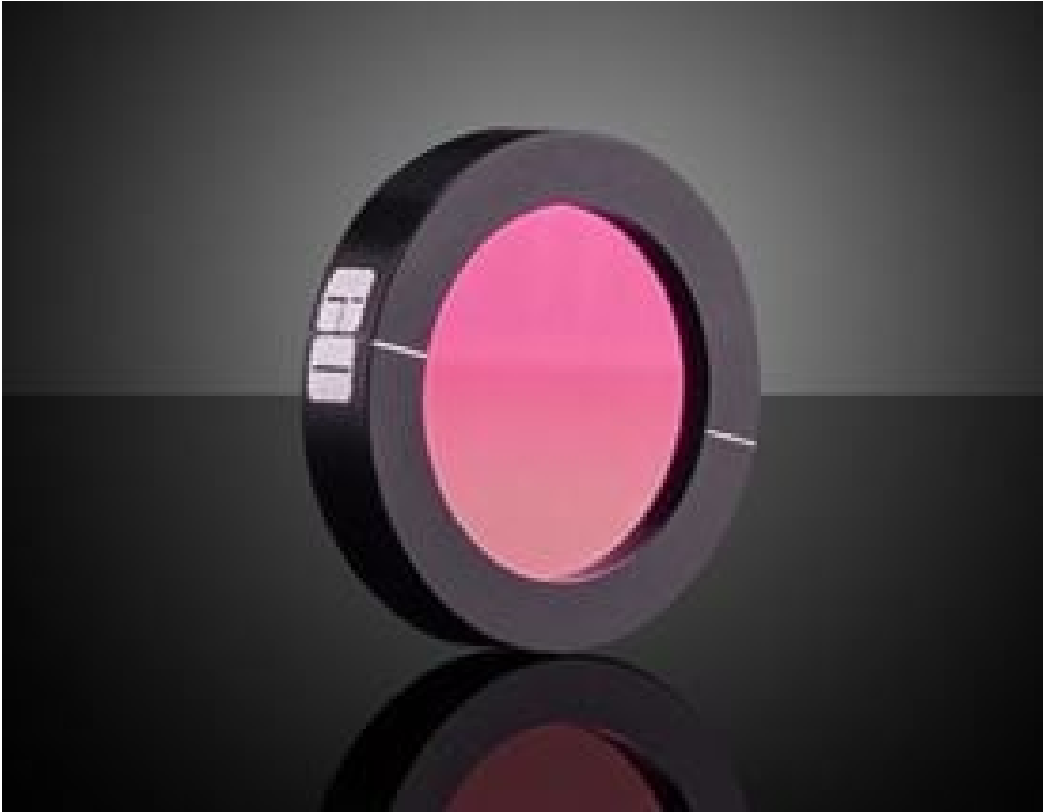
25mm Dia. ZnSe, IR Holographic Wire Grid Polarizer, #62-772