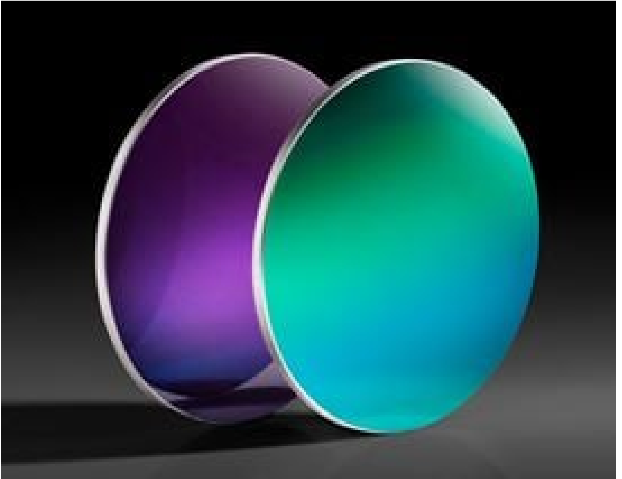
TECHSPEC Silicon (Si) Windows