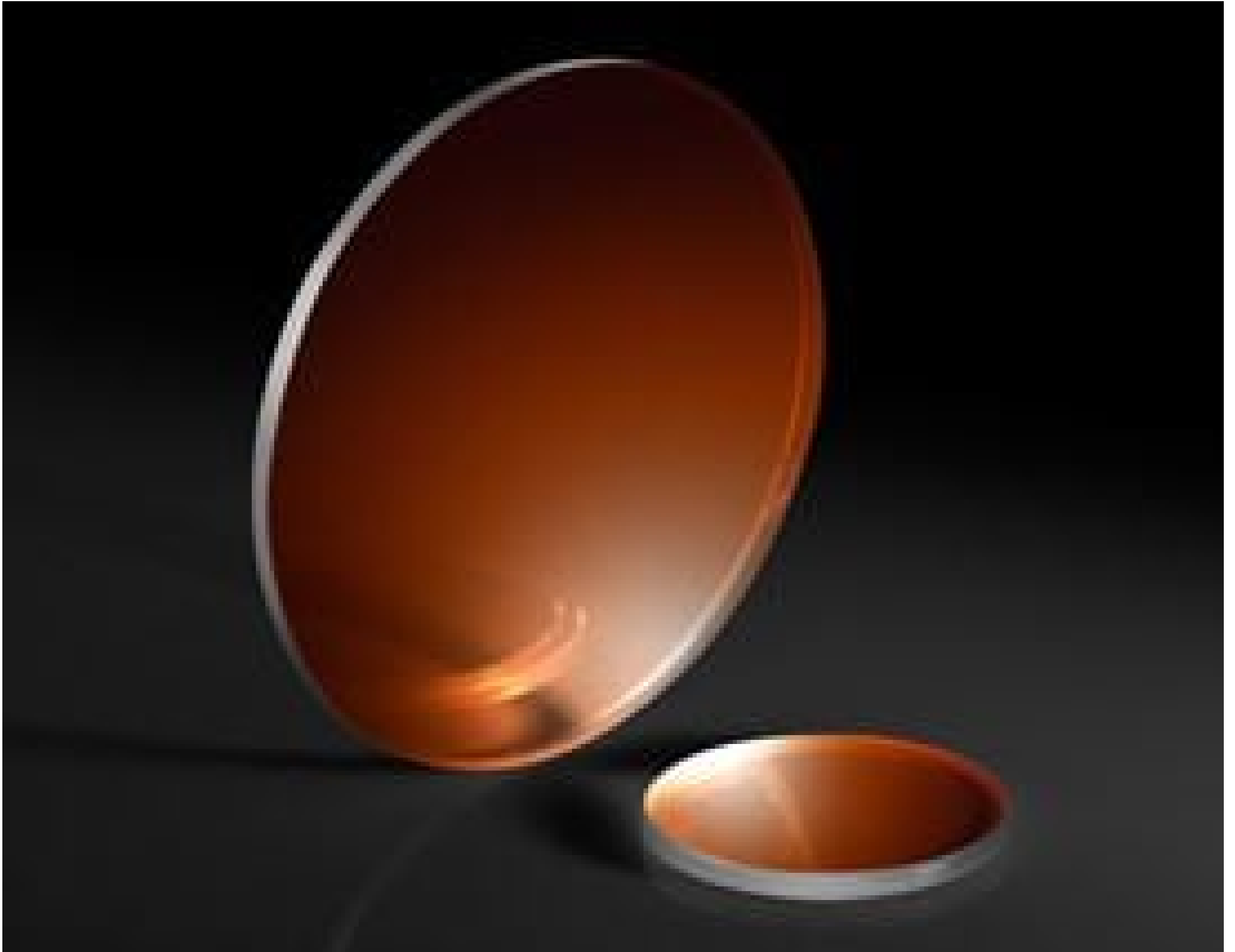
Lithium Fluoride (LiF) Windows