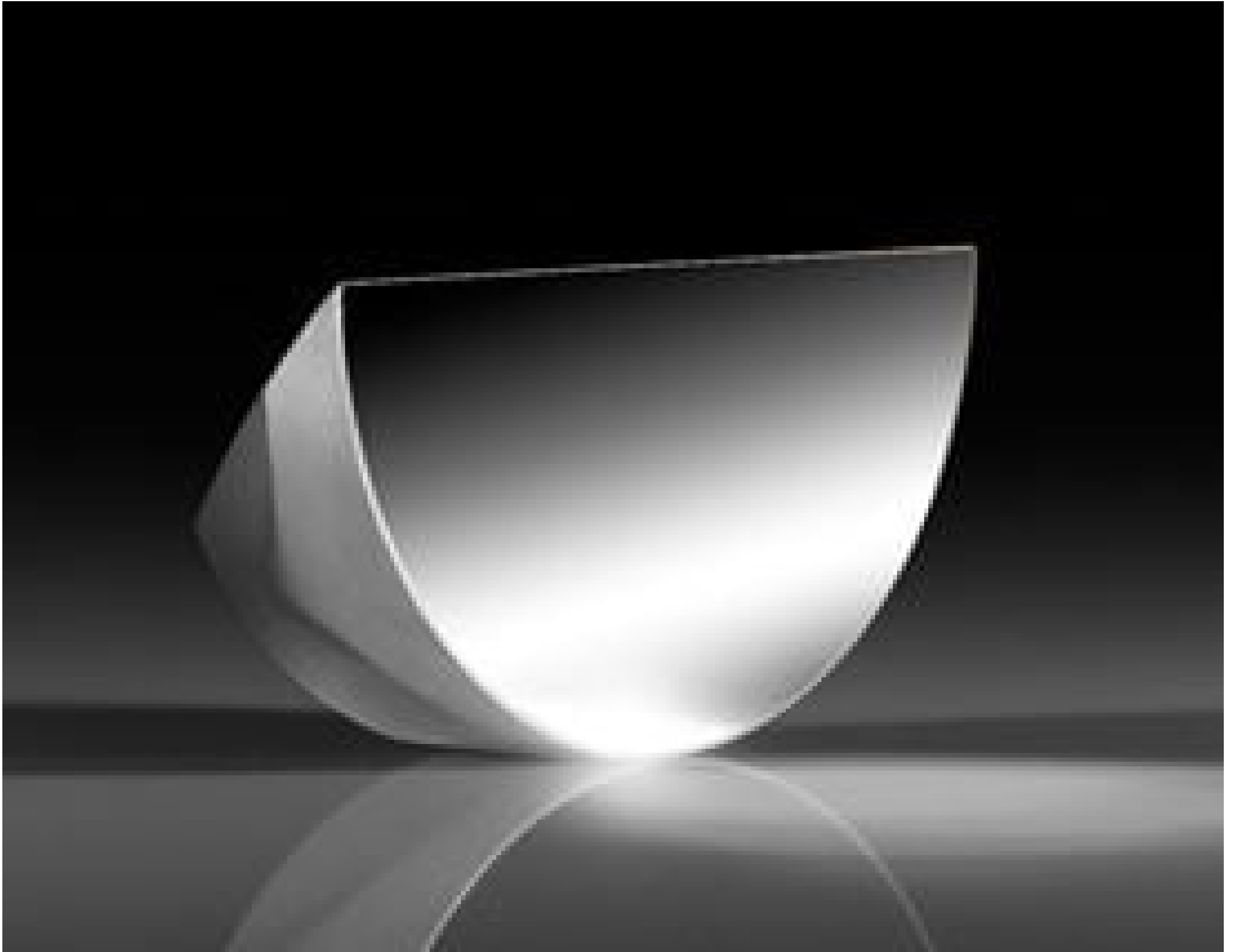
25.4mm Enhanced Protected Silver \lambda/10 D-Shaped Pickoff Mirror, #36-137