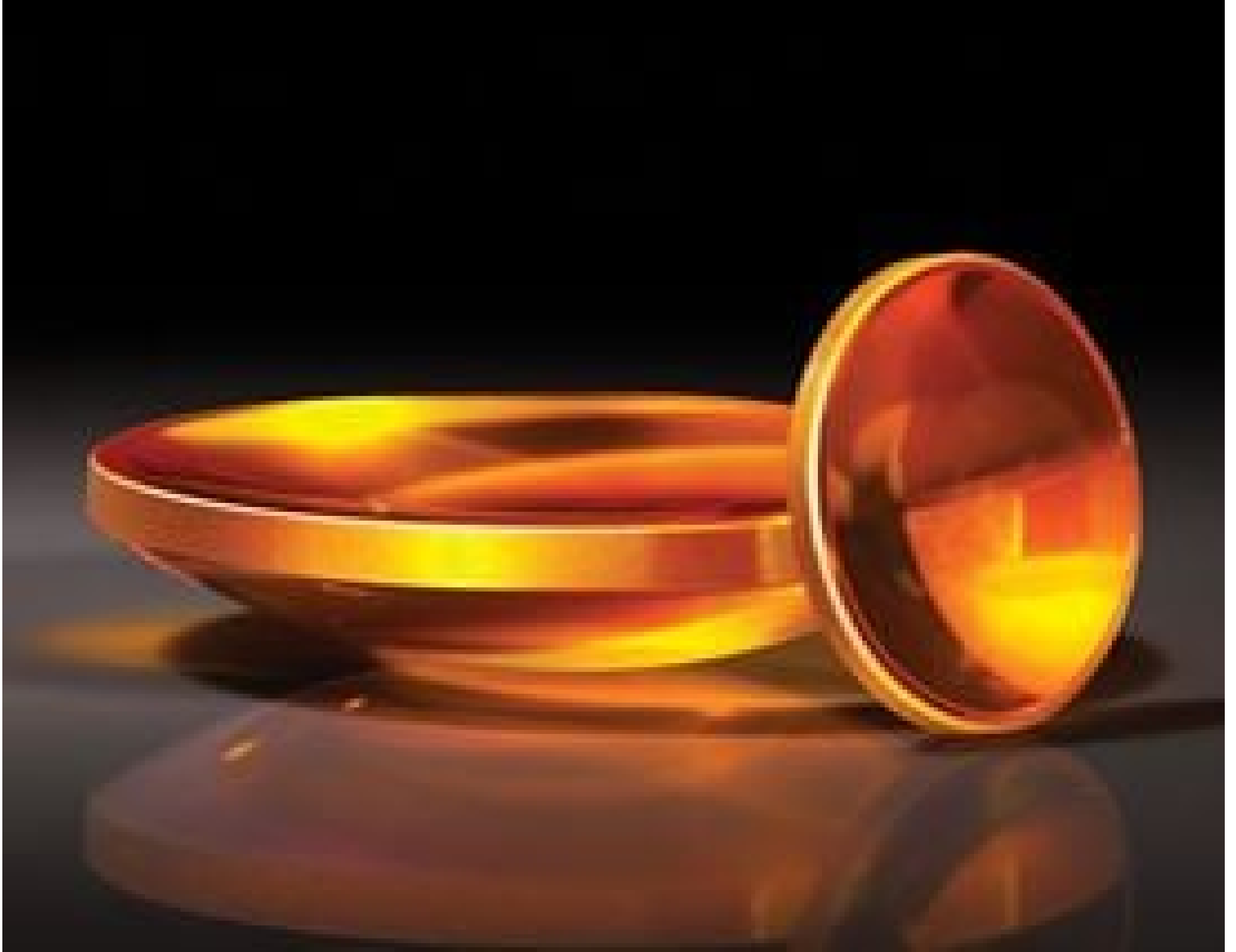
TECHSPEC Zinc Selenide (ZnSe) Aspheric Lenses