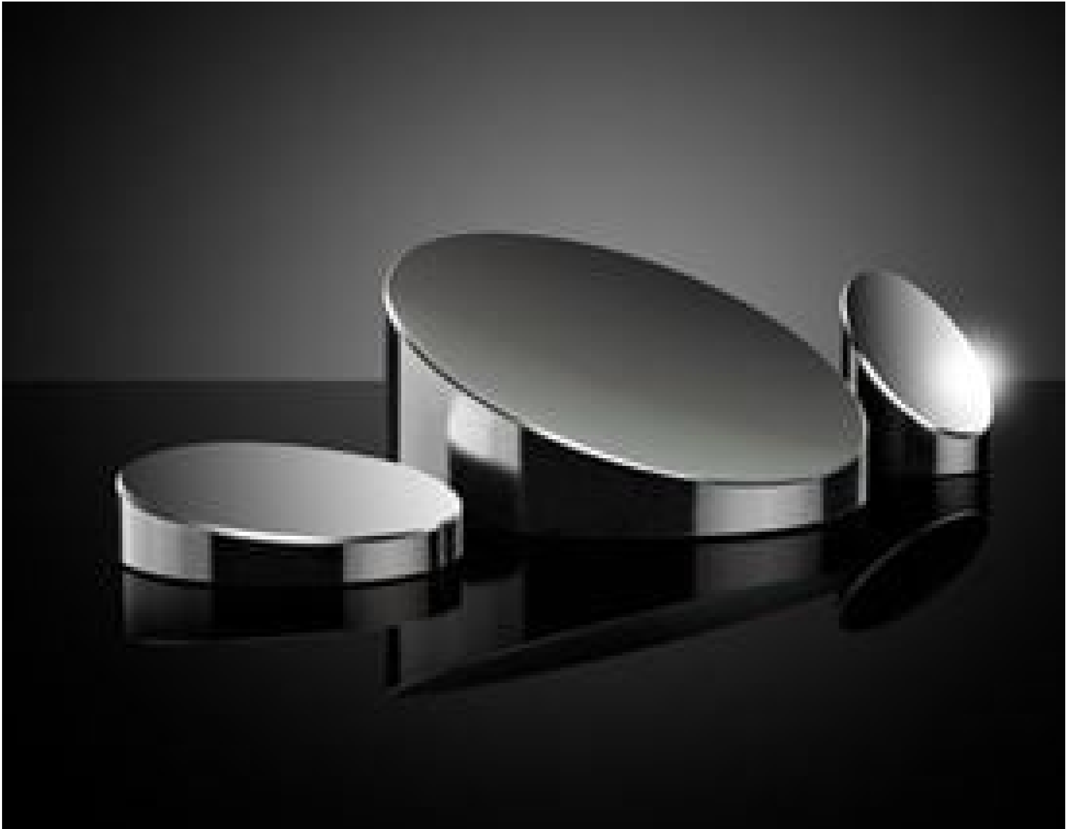
TECHSPEC Aluminum Off-Axis Parabolic Mirrors