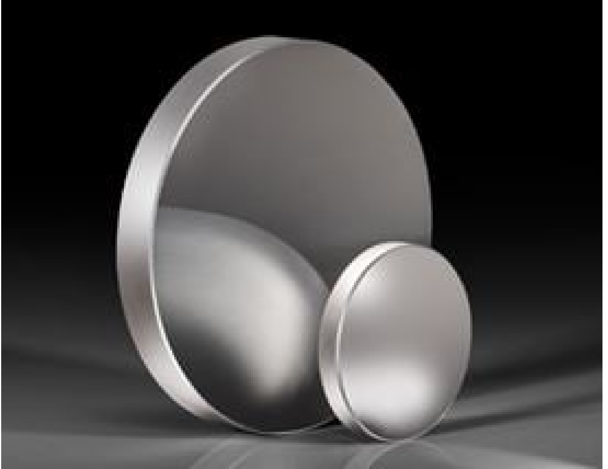
TECHSPEC® Ultrafast-Enhanced Silver Concave Laser Mirrors